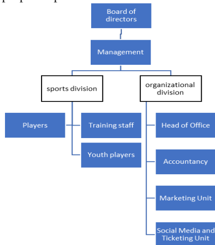
Figure 1. Organizational structure of Indykpol AZS Olsztyn in 2013

The organizational structure examined in 2013 was characterized by a clear division of the club into the sports division and the organizational division. This allowed for a quick flow of decisions and information between decision-makers and the implementation of the proposed plans.