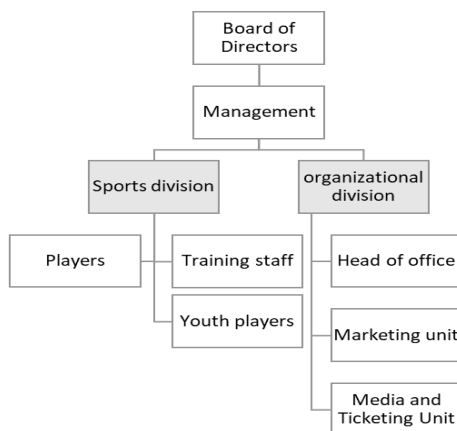
Figure 2. Organizational structure of Piłka Siatkowa AZS UWM S.A. in 2017

Source: Wiśniewski A.K., Sports Club Management on the example of Indykpol AZS Olsztyn, Journal of Health Sciences. 2013, Vol. 3(11), pp. 173.