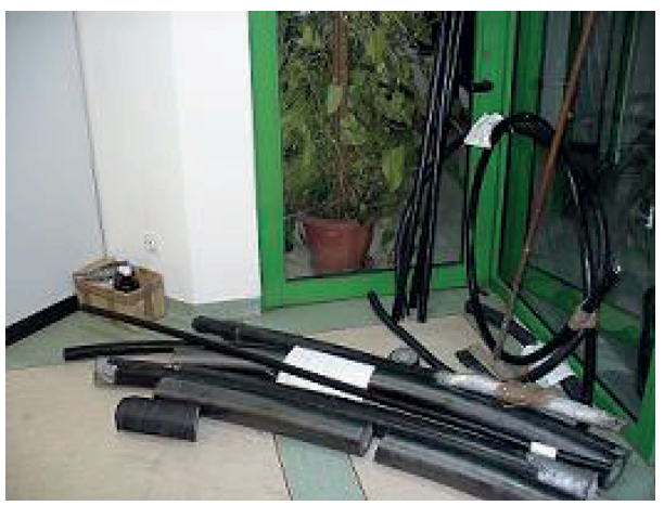
Figure 2. Examples of waste

After the implementation of 5S, the stands were ordered and all the tools were in place and were additionally described and marked. The unnecessary items disappeared and found their place thanks to the "Red Cards" used in the first stage of the 5S method, i.e. selection. From the place of storage of the finished product, unnecessary items were removed, such as foils, empty cartons, etc. The filled cartons were arranged in an orderly manner and allowing access to each of them.