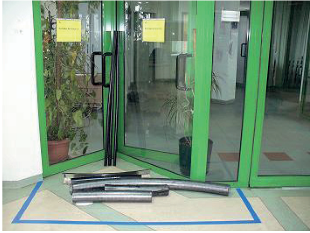
Figure 3. Examples of work organization after 5S implementation