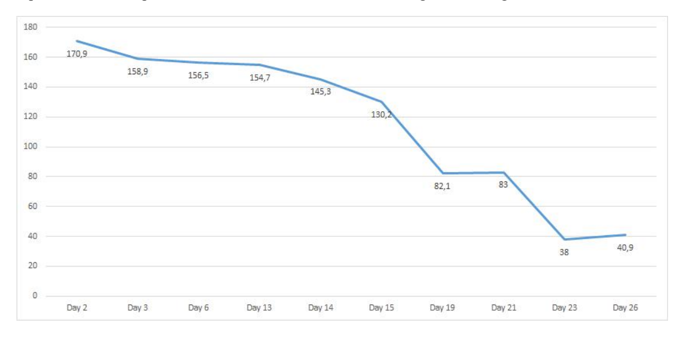
Figure 2. Chart showing CRP levels during hospitalization