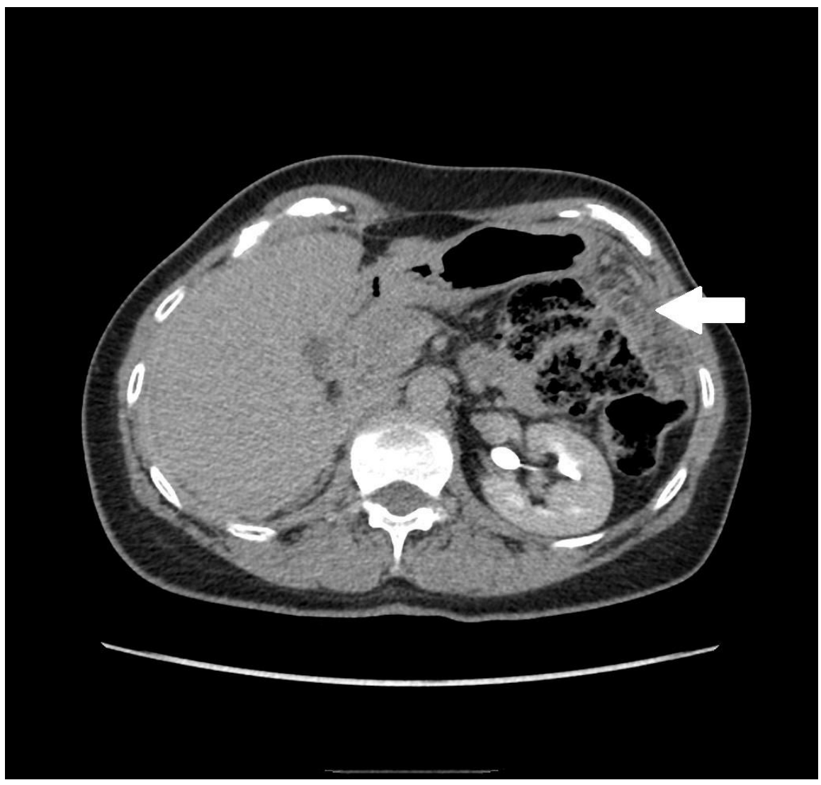
Figure 3. CT scan showing infiltration of the greater omentum "omental cake".

Staging according to FIGO classification was assessed as III C whereas Fagotti Score was estimated at 8 points [4, 5]. On day 3 patient was discharged in good condition. Pathology report confirmed clinical diagnosis of ovarian cancer. The microscopic image corresponds to the diagnosis of high-grade serous ovarian cancer. Grade 3 tumor formed papillary structures and its structure was partially solid with the presence of necrosis foci, oviduct with the presence of serous cancer infiltrate. Due to the inability to obtain complete cytoreduction patient was scheduled for NACT. Following 6 cycles of paclitaxel/carboplatin chemotherapy the complete remission as based on clinical examination, CT scan and serum levels of cancer markers was achieved [7]. Patient was readmitted for surgical treatment in a good general condition and with proper level of nutrition. Standard surgical protocol with the extended vertical median incision, hysterectomy, adnexectomy, omentectomy was performed. Upon direct visualisation there was no residual disease in the abdominal organs except the greater omentum where nodular lesions with a diameter of 5 to 15 mm were seen. Parietal peritoneum, uterus, right adnexa, small and large intestine, and other abdominal organs were clear of the disease, thin adhesions partially obliterated recto-uterine pouch.