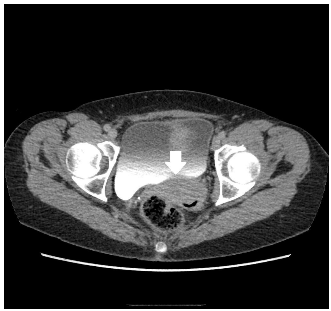
Figure 2. Blurred boundary between the bladder and uterus indicates possible neoplastic involvement of the urinary bladder.

The CT scan showed pelvic masses located in the both adnexa and peritoneal metastases in middle and upper abdomen with a diameter exceeding 2 cm. Since the operability of a such advanced disease is not guaranteed patient was qualified for diagnostic laparoscopy. Intraabdominal inspection revealed about 200 ml of ascitic fluid, extensive miliary carcinomatosis on the parietal peritoneum and small intestine and on the visible on the surface of the diaphragm. The surface of the liver was clear, the stomach looks normal. Greater omentum was extensively infiltrated (omental cake) and fixed to the parietal peritoneum. Sigmoid colon firmly attached to the lateral abdominal wall. Uterus and adnexa initially invisible due to neoplasmatic infiltration and massive adhesions. Their release have partially opened pouch of Retzius with immobile uterus attached firmly to the bladder and rectum. Peritoneum covering urinary bladder was also infiltrated by cancer. Pelvis was completely obliterated by the ovarian tumors forming firm adhesions with rectum and sigmoid colon. Left-sided adnexectomy was done, numerous tissue samples from metastatic foci were taken and sent for pathological examination.