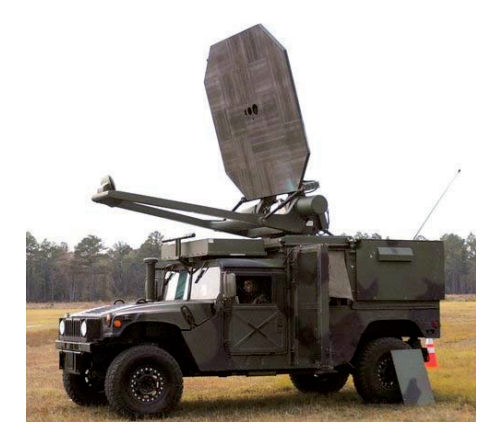
Figure 1. Active Denial System

Thanks to relatively small weight and size, the system can be transported and deployed on the field as needed. The device can be used as stationary (for force protection or infrastructure protection) or mobile by mounting it on a car chassis or even on a plane.