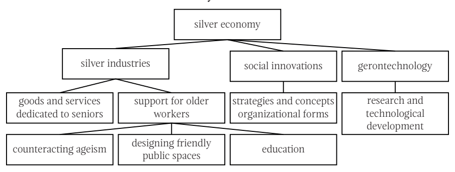
Scheme 1. Areas of activities of the silver economy