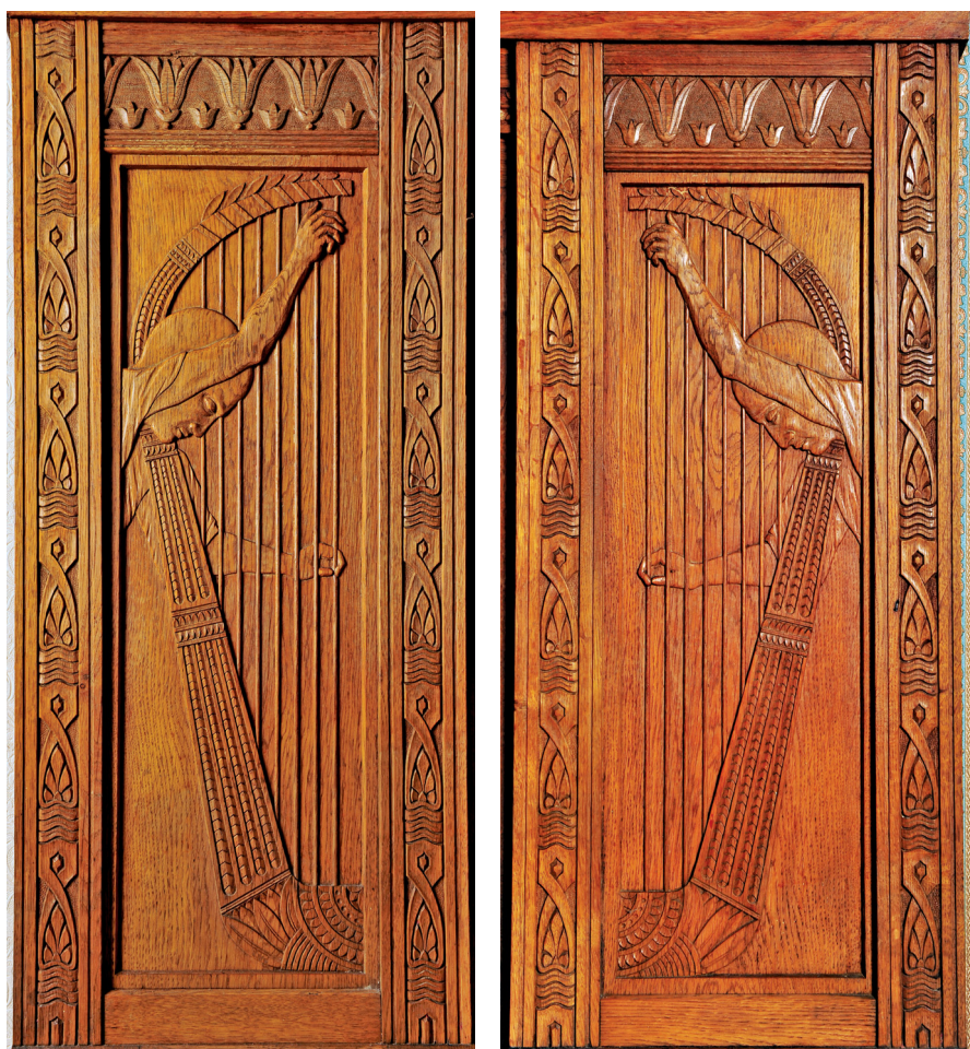
2. Nawojowa Góra near Krzeszowice. The Domański's family villa. Two panels with the representation of 'blind harpers' (1929). Oak wood, dimensions 64.0 x 21.2cm.

accessible at that time ( Fig. 3a-b ). 7 The same source was most likely drawn upon when making a guéridon (flower-stand), being an accurate imitation of Egyptian column with closed papyrus capital ( Fig. 4 ). 8