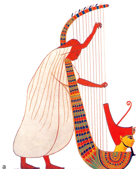
3. 'Blind harpers' from the Ramesses' III tomb (a. Rosellini 1834: Pl. XCVII; b. Erman, Ranke 1923: 284).