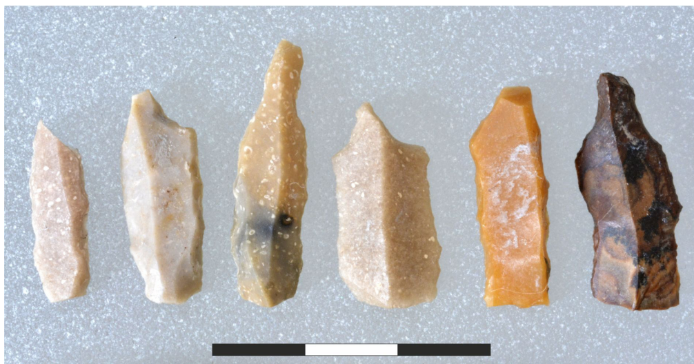
4. Selection of microdrills from Central Kom.

concentrated only in an area of about 2 x 3m in the southern part – in the fireplaces and around them.