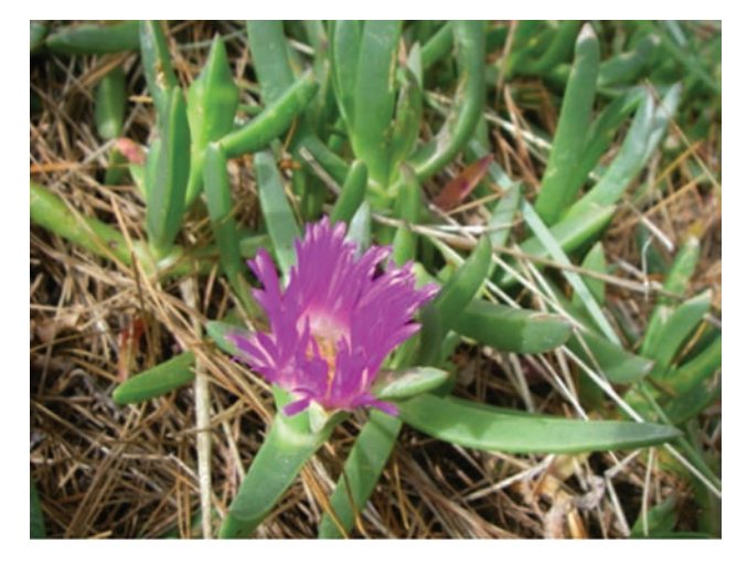
Figure 1. Carpobrotus rossii flower and leaf

The Australian native plant Carpobrotus rossii or "pigface" (Fig. 1) is a succulent glaborous halophytic perennial commonly found in the coastal foredunes of southern Australia (Venning 1984). Recent investigations conducted in the School of Pharmacy, University of Tasmania (Australia) have shown that extracts from this plant have high antioxidant activity and contain novel flavonoid compounds with cardio-protective activities (Geraghty et el. 2010). These flavonoids have the potential to be developed into a pharmaceutical or nutraceutical product, but at present the conditions required to maximise flavonoid production in this species are unknown. This study aimed to assess variation in metabolite (tannin and flavonoid) production and identify the factors driving this variation.