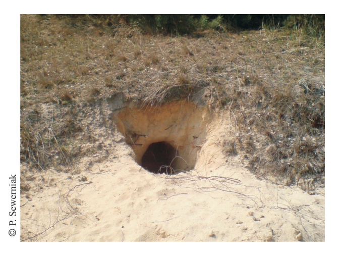
Figure 4. A wolf den in the Toruń Basin

There are more information on the occurrence of wolves in the Bydgoszcz Primeval Forest located in the Toruń Basin on the left Vistula bank. It also concerns the colonization course and population dynamics. It can be assumed that the present, stable wolf population began in this Forest in 2004. The occurrence of wolf in the forest between Bydgoszcz and Toruń was initiated in its western part. In 2004, wolves and their trails were observed in the Forest Division of Solec Kujawski and in the western part of the Cierpiszewo Forest Division (Krzemień 2008). At that time, predators visited the Gniewkowo Forest Division (the eastern part of the Bydgoszcz Primeval Forest)