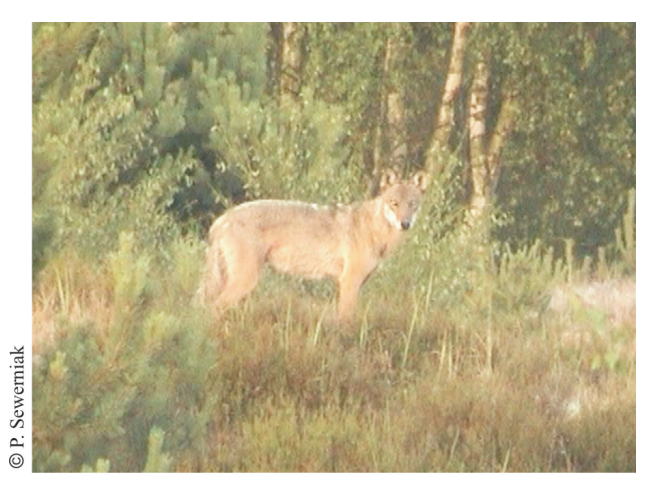
Figure 3. A young male wolf

protected species in Poland. At the turn of the 20th and 21st centuries, wolves have successfully colonized the Toruń Basin (Figs. 2, 3). Although two articles have been published regarding the present wolf population in the Basin (Krzemień 2008; Sewerniak 2008), the population has not been described yet in a scientific paper. Some authors have only noted the occurrence of wolves in the region (e.g. Jędrzejewski et al. 2002).