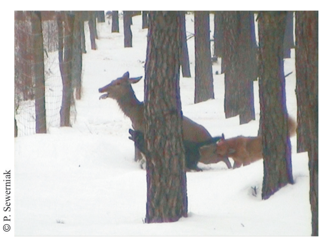
Figure 8. Feral dogs hunting a hind of red deer in winter 2005/2006

it is mostly covered with thick bushes that form favourable shelter conditions for animals.