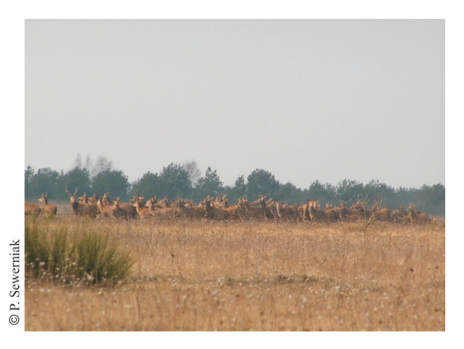
Figure 7. Deer group of about 100 individuals in the military area located south of Toruń