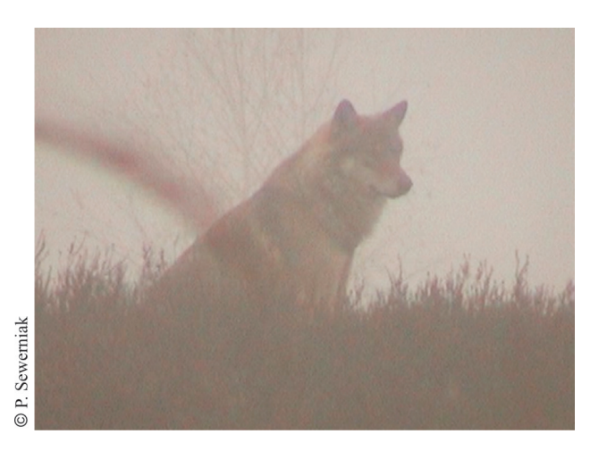
Figure 2. An adult wolf (probably one of a dominant pair in a pack of the Bydgoszcz Primeval Forest)