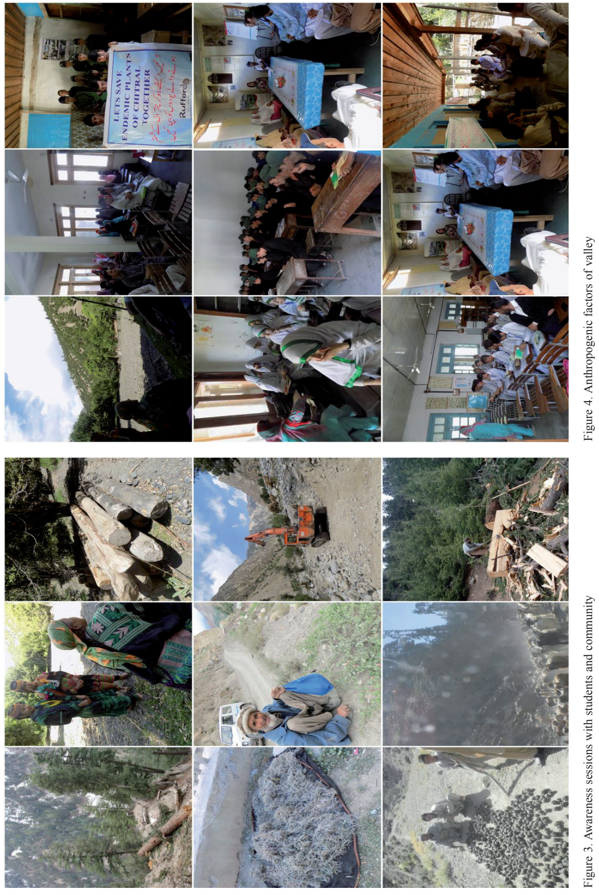
Figure 3. Awareness sessions with students and community