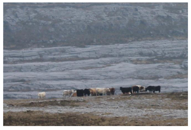
Figure 4. Winter grazing in the Burren uplands