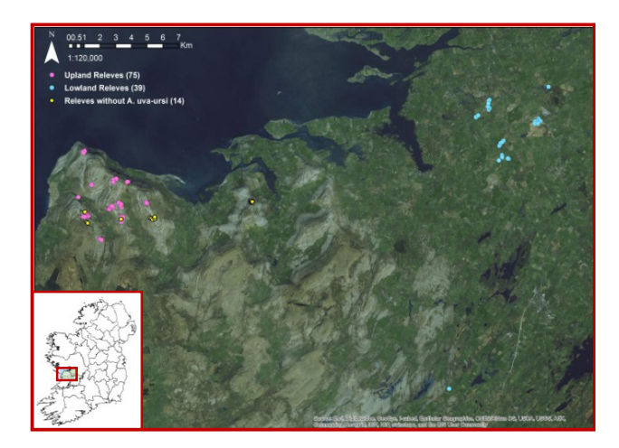
Figure 2. enlarged aerial photo of study area with relevé sites marked. Pink dots: upland; blue dots: lowland. NB the extent of exposed limestone throughout the region; (inset) map of Ireland showing Study Area