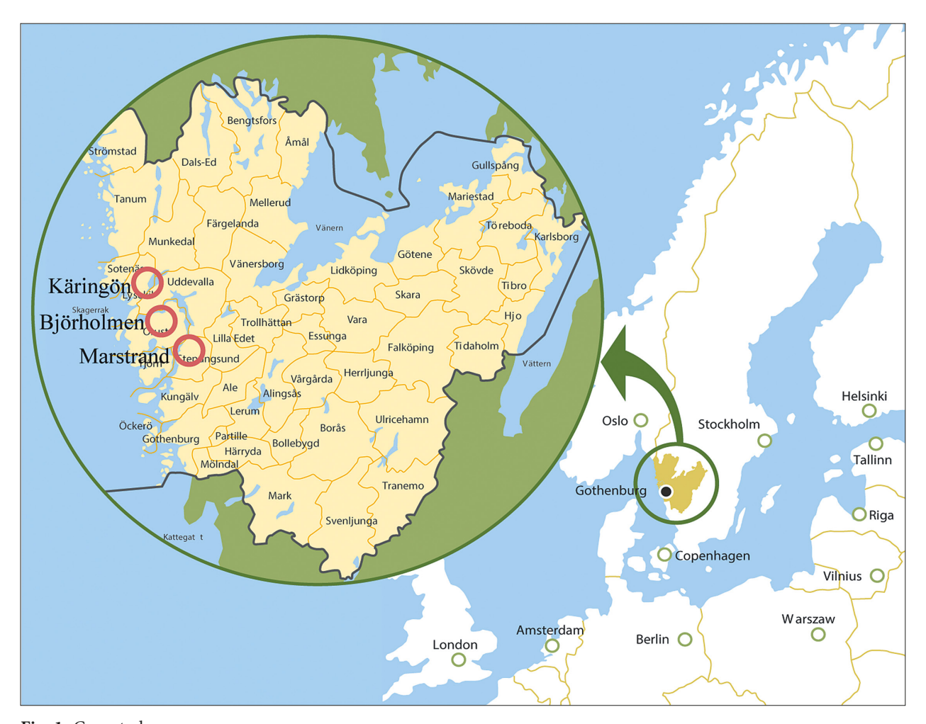
Fig. 1. Case study area

the population and secure stable sources of income (Fredriksson, Larson, 2013). The three communities in Bohuslän presented in this article all face, yet in different stages, outmigration, a decrease of traditional industries, and an increase in tourism and recreational activities.