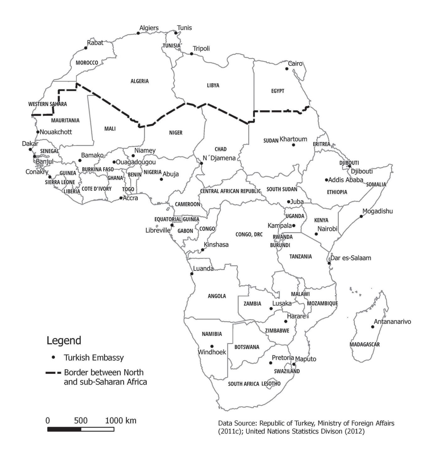
Fig. 2. Demarcation between North and Sub-Saharan Africa and the Turkish embassies in African countries

Akgün termed the Turkish policy towards Sudan as a 'passive quiet diplomacy', which means a "middle ground between accusations of "genocide" and defending al Basheer's position" (Özkan, Akgün, 2010b). It consisted in the developing of economic and political relations with Sudan and Turkish dip-