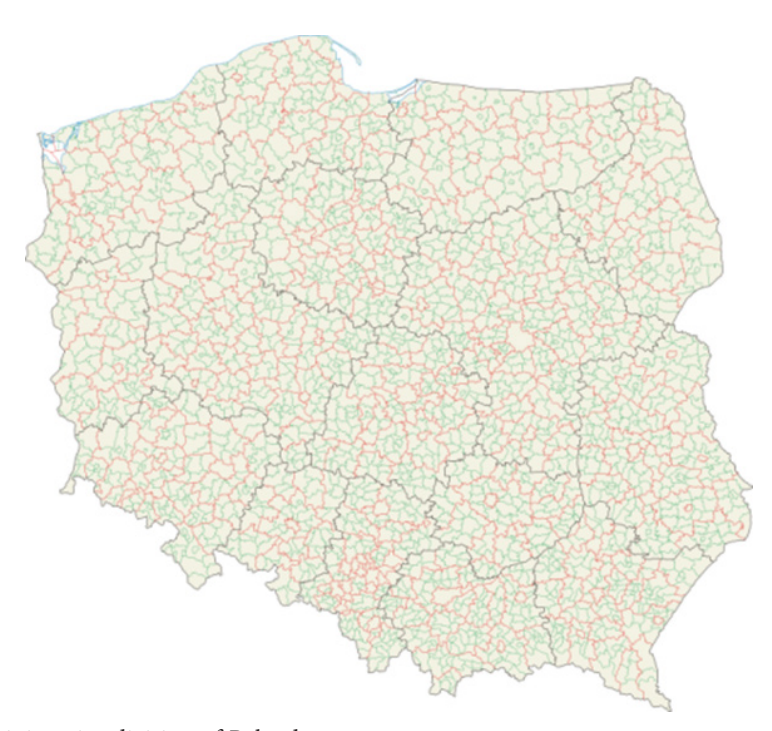
Fig. 1. Map of the administrative division of Poland