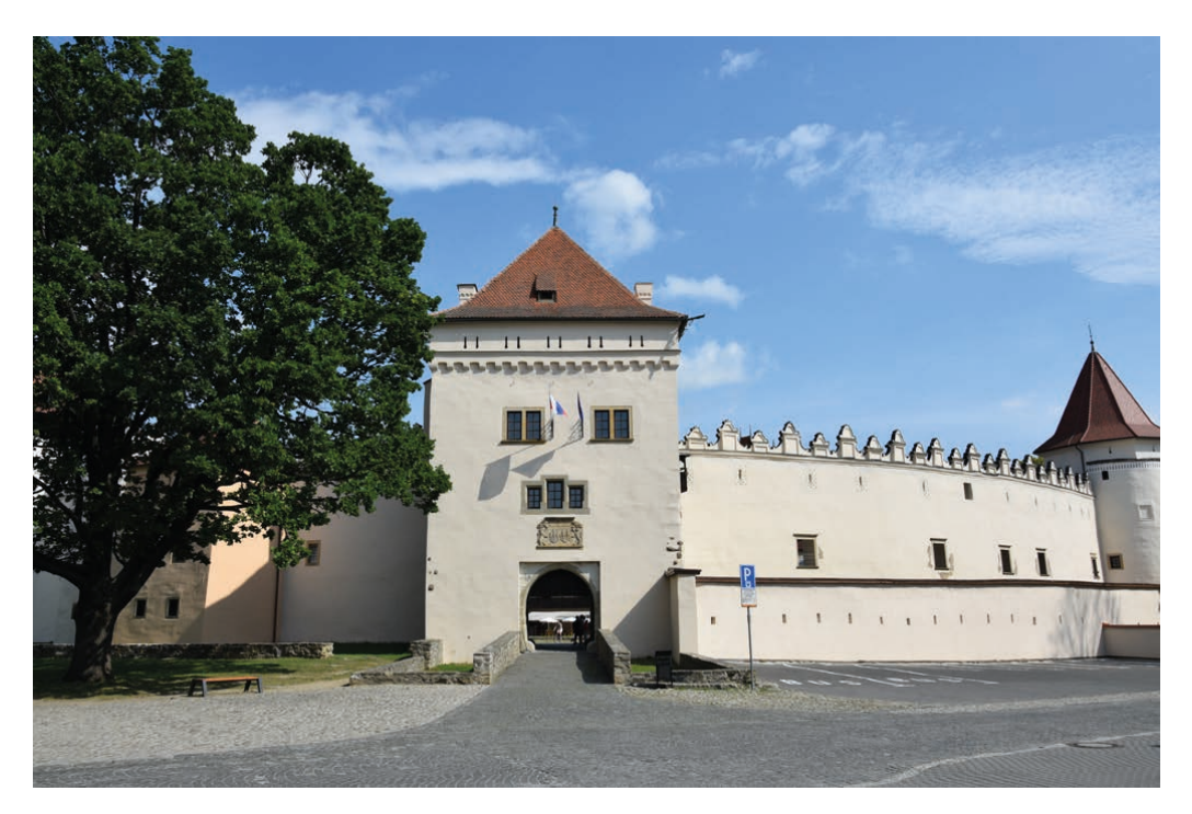
Fot. 8. Current view of the castle - the seat of the Museum in Kežmarok

Castle as the construction of the century. This lengthy process of the reconstruction was due to an inconsistent approach to the construction work (at times the work was suspended or the workers were moved to other workplaces) or work was done in the wintertime. The inconsistency of the work regarding the reconstruction of the castle caused many problems which were remedied in the past fifteen years. These shortfalls should have been remedied as a part of the overhaul of the castle, but these works were not fully carried out earlier. The poor condition of the roof required its replacement over almost the entire castle building.