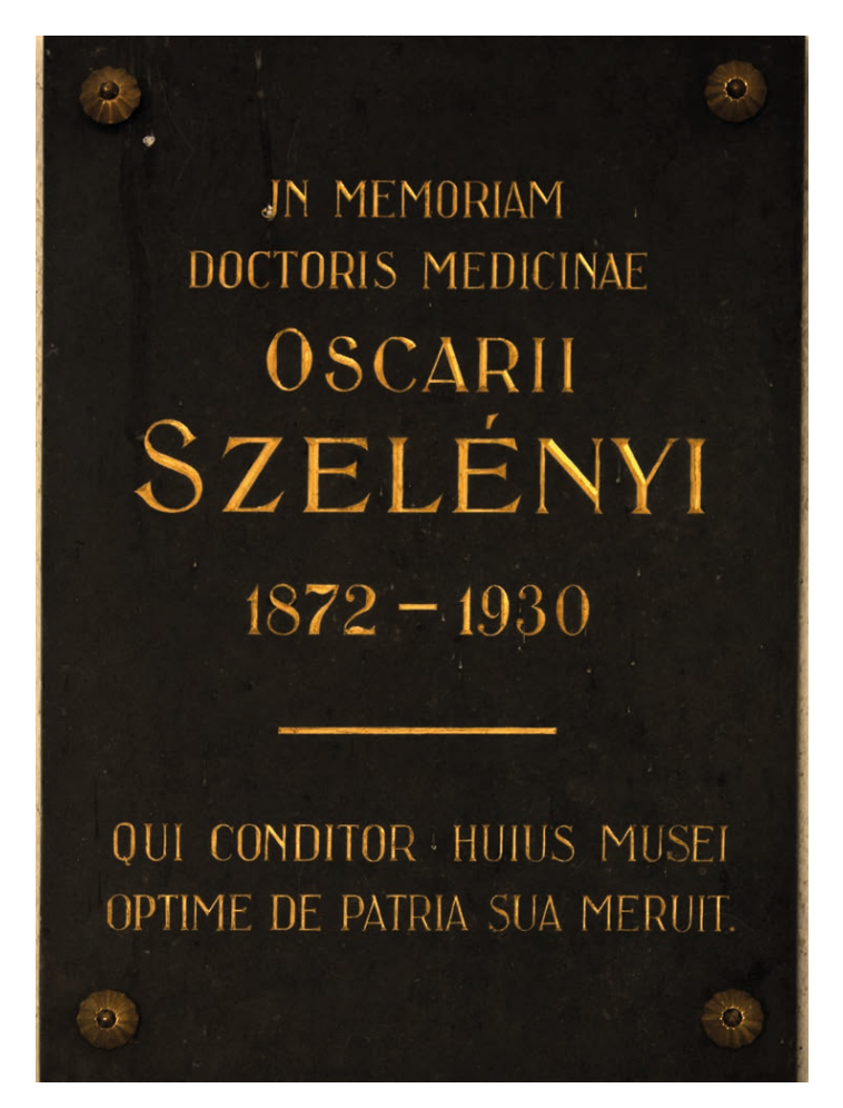
Fot. 6. Memorial plaque of the museum's founder - Oscar Szelínyi placed at the entrance to the castle

Crowns for the repair of the castle. The main investor were the Department of Education and Culture of the Regional National Committee in Košice, and the District National Committee in Kežmarok.