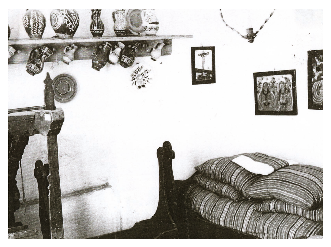
Fot. 5. First expositions in the castle

logical items, ceramic products dating to the 19<sup>th</sup> century, 17<sup>th</sup>-century weapons, pictures painted on glass and cloth, and minerals or fossils.