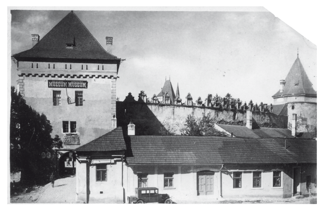
Fot. 2. Castle from 1931, when the museum was founded

and numerous works of art. All these objects were acquired by the museum mostly at no expense.