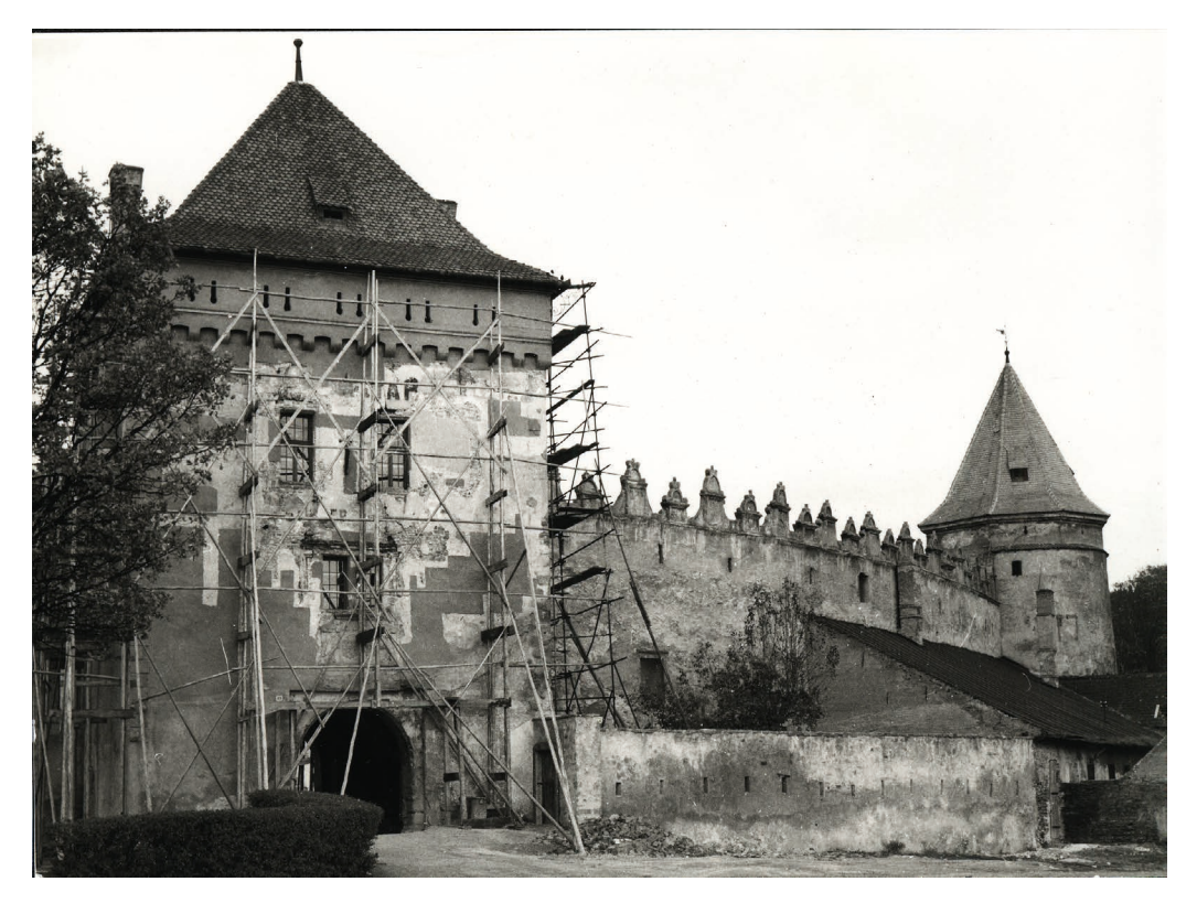
Fot. 7. Castle during reconstruction around 1975

museum's offices), storage space and library. During this period, the museum owned and managed a total of seven buildings (a wooden articular church, a lyceum, a castle, a bastion of the city fortification, two burgher houses and a poorhouse). Although the wooden articular church was in operation and the attendance was relatively high (there were 50,979 visitors in 1977), the pleas by the museum as well as by the city for the accelerated renovation were not answered. It regarded mainly the need to repair the roof which was considered an urgent matter.