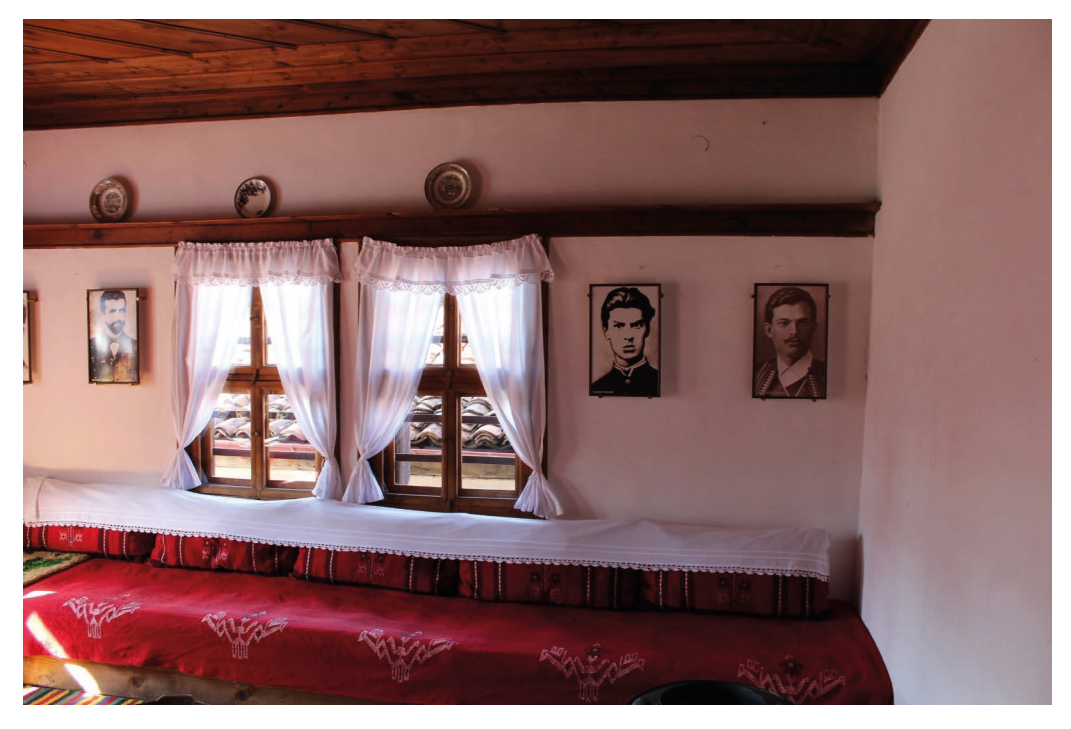
Photo 3. The use of walls as exhibition space for images at the Georgi Benkovski Museum

has merit for his virtues. Constructed in an extremely identical way, this setting contains "mandatory" elements that are observed in all house museums: a fireplace, a table and three-legged chairs, rugs and carpets, utensils, chests, baby swing, spinning wheel, paintings and photos on the walls. The claim to recreate an authentic environment is violated precisely by the last element, which is always at odds with the reconstructed period. For example, in the annotated room in the Georgi Benkovski House Museum in Koprivshtitsa, we see hanging portraits of the revolutionaries in the April Uprising from the region, which were especially popular during the period of socialism. In the Rayna Knyaginya House Museum, next to the place where she hid the rebel flag, we see a photograph of her from 1901 with the same flag. In this way, the walls go beyond the context of the recreated setting and perform the functions of museum showcases, without being such. Another common point in the reconstructions of an authentic environment is the presentation of tools or products related to the livelihood of the hero's family.