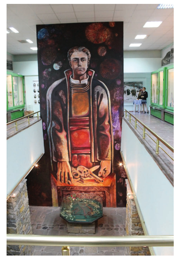
Photo 2. The personal weapon of Vasil Levski in Lovech

where the information about the relic tells, albeit briefly, about the history of its use. The chronological (event) contextualization is supplemented with a figurative one, as the subject is located in front of a reconstruction of an insurgent uniform from the April Uprising, which represents the vision of the voivode.