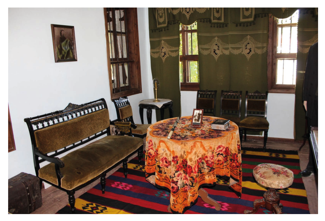
Photo 5. Interior of the Dobri Voynikov House Museum

are complemented by modern European ideas of the era, and innovations in the life of Bulgarians happen only for the better.