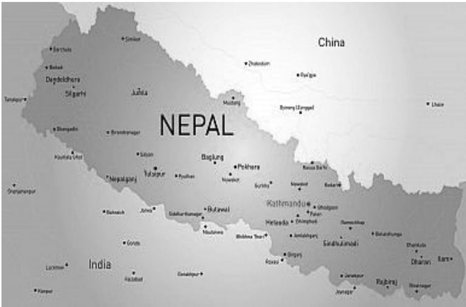
Map 2. Geolocation in Nepal