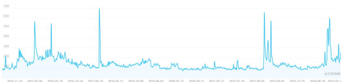
Figure 3 Mobile Search Trend of the Baidu Index for the Thai film “the Teacher's Diary” from March 20, 2014, to March 19, 2025.

Figure 2 PC Search Trend of the Baidu Index for the Thai film “the Teacher's Diary” from March 20, 2014 to March 19, 2025.