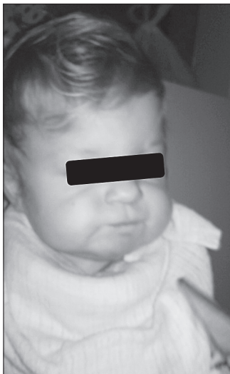
Figure 3. The girl at the age of fourteen months with improved jaw control

In terms of speech development, the girl showed very good understanding, she followed the commands: insert, pull out, give, take, give it to your mommy, show