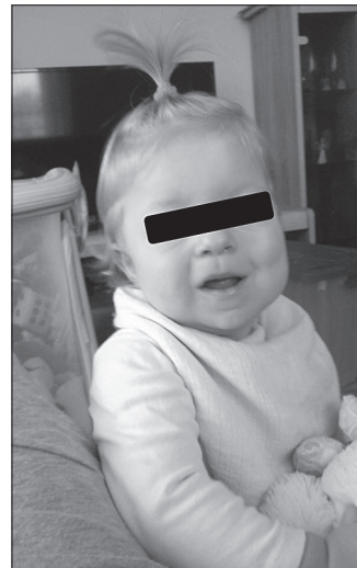
Figure 4. The girl at the age of fifteen months

Physical rehabilitation and speech therapy were conducted in the second year of life on a regular basis. The girl was very active in her physical activity. At first, during speech therapy sessions she was not willing to allow us to teach eating and drinking or do any treatments connected with her face. Numerous attempts were made to teach self-feeding. Initially, after the operation, she was fed with ready-to-eat jars, after some time enriched the menu with cooked vegetables, quail eggs, steamed apples, mashed apples, rabbit meat, broccoli and carrots and sweet potatoes with a small amount of olive oil. The food was mashed with a spoon or crushed with a fork. After a few months of practice, it became a very good element to improve the tongue activity and self-feeding. During chewing the tongue and oral cavity presented very good patterns of eating, the tongue was sporadically protruded (Figure 4).