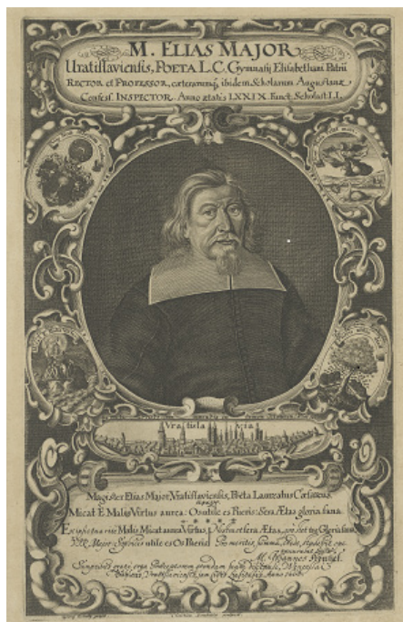
Fig. 1. Elias Maior , engraving by Christian Romstet, 1667

(Universitätsbibliothek Leipzig, Porträtstichsammlung, Inv.-Nr. 31/56)