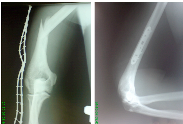
Fig.1 19 years old patient with spiral 1/3 distal humerus bone fracture.

Upon being admitted all patients reported pain in the upper extremity, movement impairment of shoulder and elbow joints. Clinical examination revealed local swelling and bruising of the shoulder, a slightly asymmetric contour, severe pain during palpation, pathology of mobility, hematoma. In three cases radial nerve palsy was observed. Only one person during the fight had gained advantage over her opponent in the moment of injury. The other persons were in the defence while wrestling, when the fracture occurred.