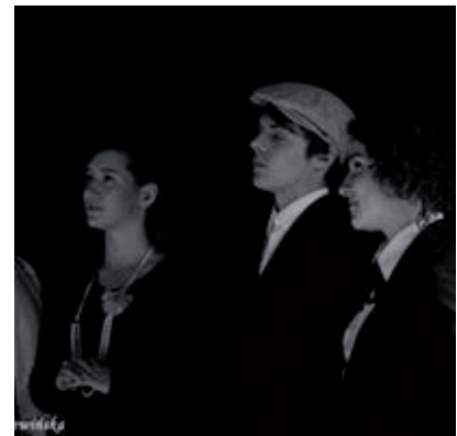
The Visitors to Summersoft.

The two most overdressed characters were certainly Prodmore and his daughter: the symbols of the old England in a frock coat and a bouffant red dress.