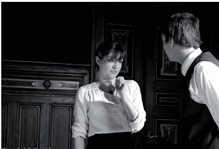
Mrs. Gracedew meets Chivers.

with the “authenticity” of the poor English servant Chivers, a representation of her preconceptions of old Europe: slightly dilapidated but with a heritage lacking in the prospering, yet culturally unrefined United States. Her go-get attitude allows her to compensate for her shortcomings, as it is Mrs. Gracedew who gives Captain Yule a tour of his own house, explaining all the intricacies of its architecture and decor. As they speak, she reveals to be alien to the political divisions of Europe of the time. Neither a conservatist, like Prodmore, nor a liberal, like Yule, she is pragmatic and her opinions adjust to the circumstances. Through discreet hints, James signals Mrs. Gracedew’s growing affection for Yule, as he finally consents to marry Cora, ignorant of the fact that Cora is not willing to marry him. Upon learning that Cora’s heart belongs to Mr. Buddle, the son of a wealthy businessman from the neighboring Bellborough, Prodmore is furious. His rage is appeased, however, when he learns that Mrs. Gracedew is willing to buy back the mortgage on Summersoft for considerably more than it is worth. The play heads towards a happy ending with Captain Yule so grateful to his benefactor that he proposes marriage.