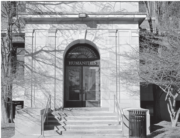
Creighton University, Omaha, Nebraska.