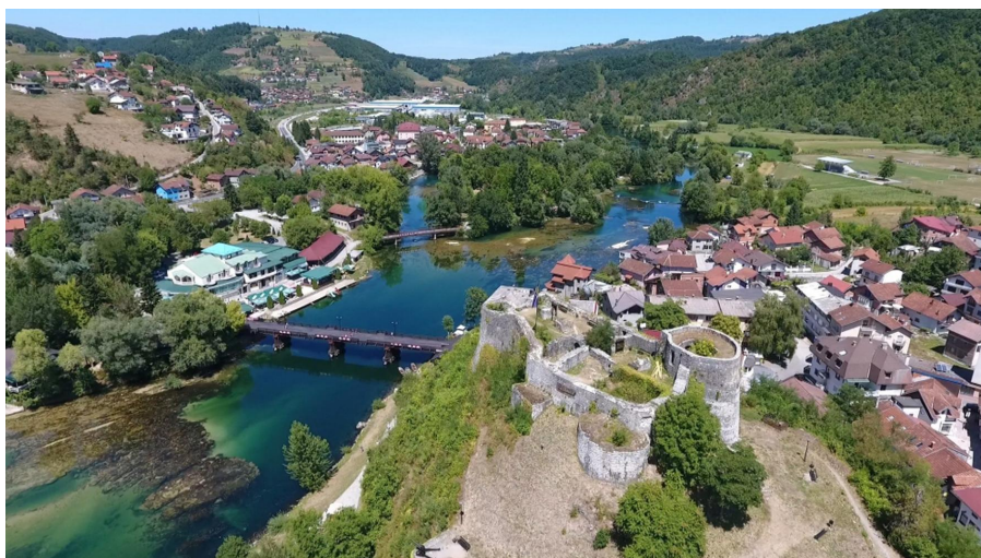
Fig. 4 — Krupa castle today