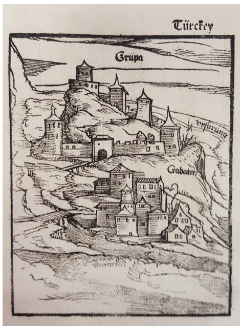
Fig. 2 — Krupa — castle and marketplace in 1530