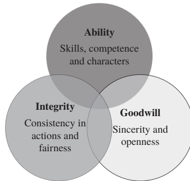
Figure 3. Three dimensions of trust