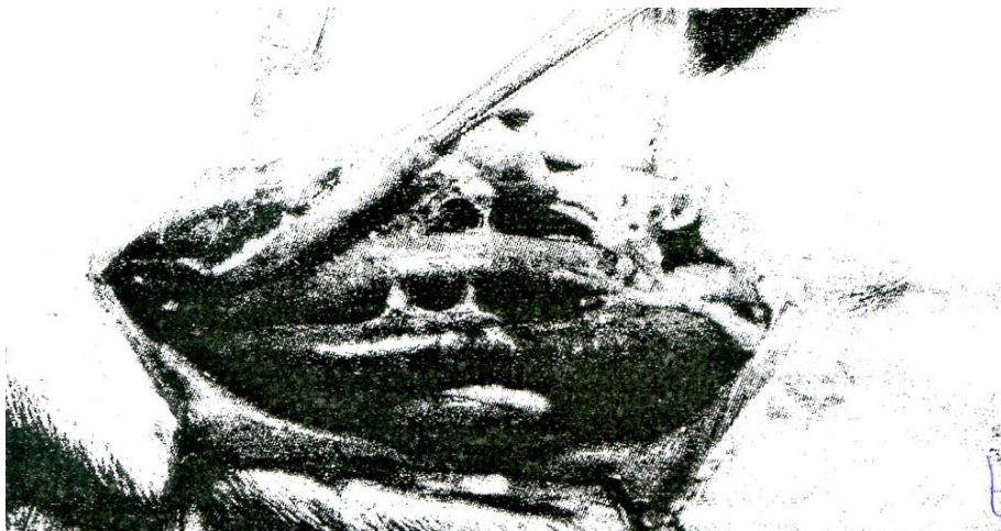
Figure 1 – General view of the rat peritoneum on the third day of experimental peritonitis.

In the terminal state, on the third day, most animals did not rise, were adynamic, did not respond to palpation of the abdomen, there was a violation of respiratory rhythm and heart rate. On autopsy of dead animals in the abdominal cavity were found a muddy effusion. The loops of the intestine are swollen without peristalsis, on their surface you can see a significant number of fibrinous layers, hyperemia of the visceral and parietal peritoneum with injected vessels. Between the loops of the intestine, as well as between the parietal peritoneum and intestine, there are multiple, easily torn joints of different lengths and shapes.