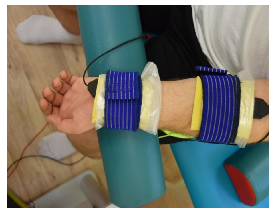
Fig. 3 TENS along the median nerve in the wist-own source [6].

In TENS electrode is used having a diameter of 3 cm, which are laid longitudinally along the median nerve in the wrist. (Fig. 3) To stimulate the area of the wrist joint radially used parameters such as frequency of 150 Hz, pulse duration of 200 ms and the flow adjusted to the patient's feelings. The patient should feel a vibration or tingling sensation under the electrodes [11].