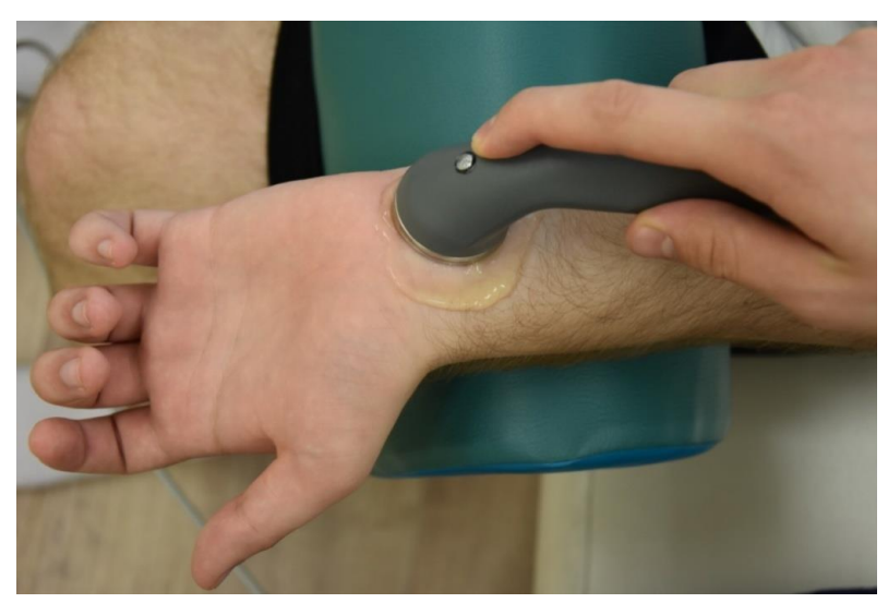
Fig. 2 Ultrasounds therapy on the wrist [6].

Ultrasound is often used in the treatment of carpal tunnel syndrome. In the early period of the intermediate and neuropathy, are part of the ultrasound treatment of the median nerve conduction, but also connective structures. Due to the position of the median nerve uses the ultrasound pulse. The fill factor of the period should be 25% and the energy intensity approx 1~\rm W/cm^2 , and thus the average intensity time should be 0.25~\rm W/cm^2 . For sonication median nerve head used in an area of 1~\rm cm^2 and frequency 3~\rm MHz wave (Fig. 2) [11].