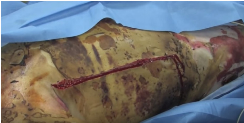
Pic. 2. Escharotomy of III° burn injury

Unfortunately, despite multidisciplinary treatment patient's condition deteriorated significantly in the next 3 hours, leading eventually to decrease in blood pressure and cardiac arrest. Because of severe electrolyte, coagulation and metabolic disturbances resuscitation was ineffective.