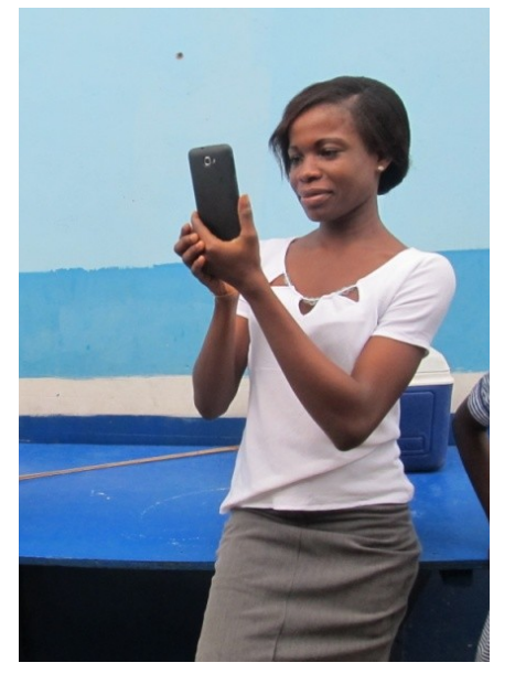
Fot. 2 Easy internet access and common use of mobile devices In Ghana and Kenya

Not only physicians, but also other medical staff would be able to use telemedicine. According to the World Health Organization, in Ghana in 2015, the number of doctors per 1,000 inhabitants was only 0.096. [1] As mentioned above, most doctors work in large and medium cities. In small health centers located in rural areas, only nurses and Physican Assistants work. It should be emphasized that approximately 70% of health care facilities are located in small villages. These clinics employ only Physican Assistants [5]. The use of a satellite or radio transmission regarding the assessment of a patient's health implies the need to appoint a medical coordinator. The medical coordinator, based on an interview conducted by the Physican Assistant and the results of the patient's examinations, after consulting the Physican Assistant would help in diagnosing and determining the further therapeutic path for the patient. The possibility of consultation between Physicist Assistants and doctors from larger centers would make it possible to improve the quality of health care in rural areas.