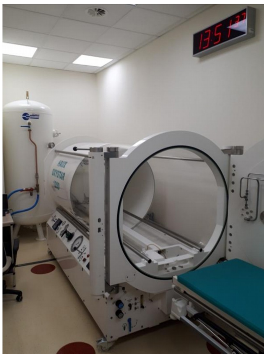
Pic. 2. A monoplace hyperbaric chamber in the Hospital Emergency Department at the University Hospital named after Antoni Jurasz in Bydgoszcz - own archive.