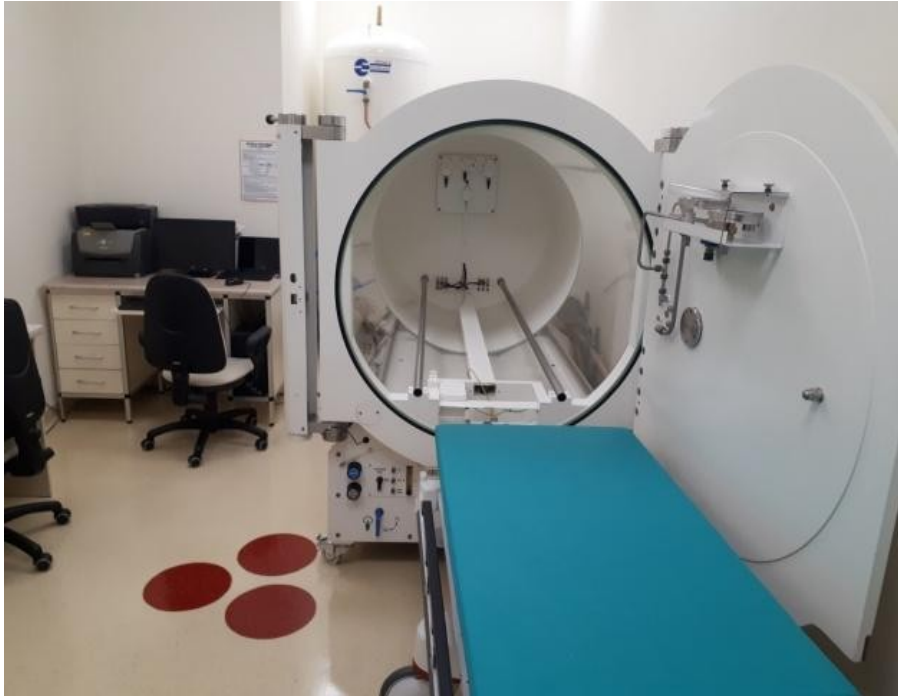
Pic. 1. Medical office with a monoplace hyperbaric chamber in the Hospital Emergency Department at the University Hospital named after Antoni Jurasz in Bydgoszcz