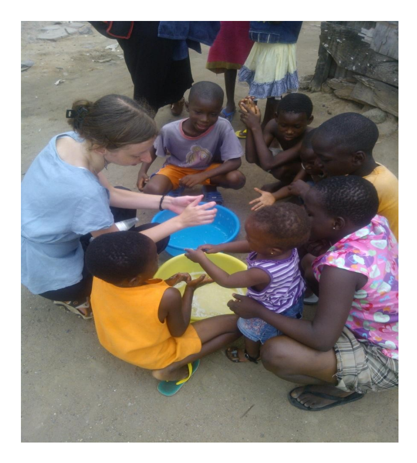
Fot. 2. hand hygiene outreach programme

In Ghana, 28% of the population has no access to electricity, and for the others, this access is not permanent. The current is regularly disconnected (dumsor) [6]. This makes it impossible to even store food at low temperatures. During the stay in Ghana, it was also noticed that the selection of appropriate methods for storing and preserving food for specific products could contribute to reducing the incidence of food poisoning. The inability to store food at low temperatures and the diversity of nutritional behaviors caused the appearance of roadside food trade. Nearly on every crossroad there is fast food offering fried yams, grilled plantains, fufu and increasingly popular Chinese soups.