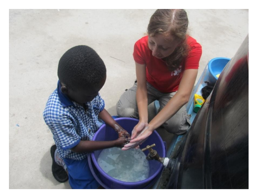
Fot. 1. Teaching hand hygiene In schools