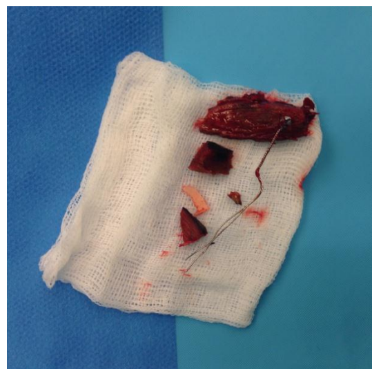
Fig. 2 The wooden twig removed from the right orbit

Postoperative period was without complications. Patient responded well to painkillers and was discharged from the hospital four days after the surgery with recommendations for maintaining oral hygiene.