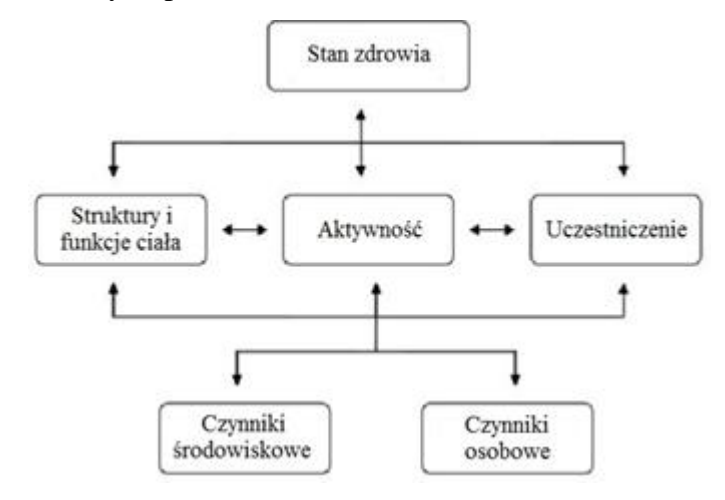
Diagram 1 . ICF classification scheme

During therapy, its aim should first be determined. For this purpose, we can use the ICF classification. This classification requires objective tests to be performed both at the structural level and at the level of activity. In the structural context, measurement tests and tests are carried out, eg on the range of movable property of SFTR. Performing tests is aimed at hypothesizing the cause of the problem with performing everyday activities (ADL) (diagram 1). At the level of everyday activity, repeatable measurement tests are made that are described in a measurable manner [14].