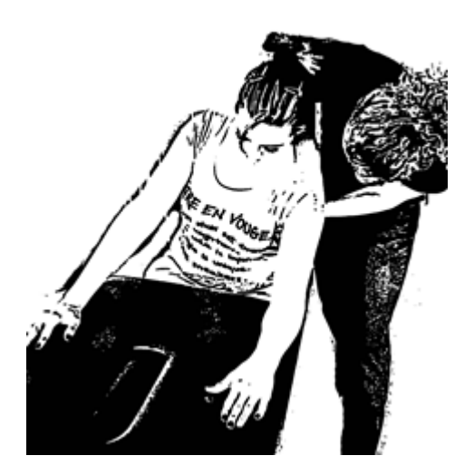
Figure 4. Support on the forearm of the left hand in the closed chain. Approximation of the shoulder to strengthen the stabilization of the shoulder blade. The other limb of the patient - an extension in the elbow to transfer the weight to the right leg

During exercises that affect the stability of the spatula, attention should be paid to whether the ascending part of the trapezius muscle is stimulated. With proper support activity, active lower torso flexors. If the ridge rectifiers turn on during the exercise, it may mean that the patient is pulling the retraction blade.