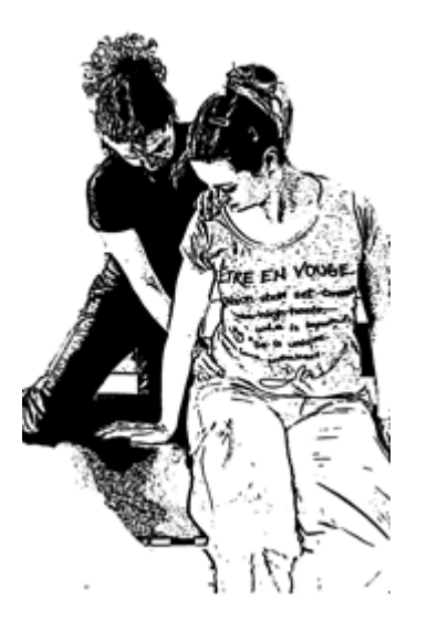
Figure 6 . Activation of supports in a closed chain. Transferring the weight of the body to the upper right limb. The therapist, by approximation, facilitates the stabilization of supports.

Support activity in a simple force to activate the front and widest dorsal muscle can be obtained by working in a force. The patient learns the stabilization of the spine with his palm and also can independently control the muscles of the widest back and the anterior tooth by lifting the hip on the same side (Figure 6). By stabilizing the blade, there is a change in the load transfer point. Movement of the pelvis transfers the load and motion to the joint with the stabilized shoulder blade.