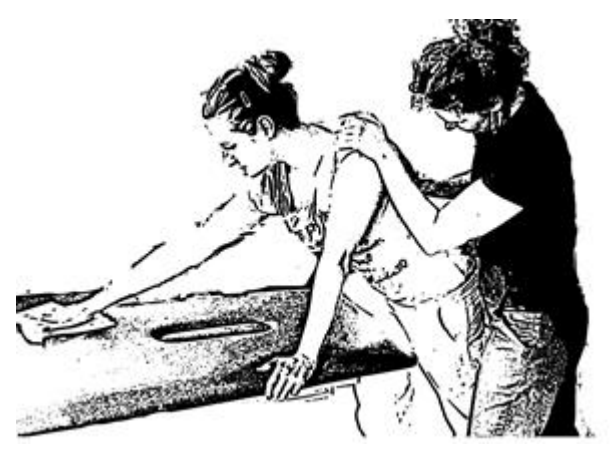
Figure 5 . Activation of supports in a closed chain. Transferring the body weight to the left upper limb. The therapist, by approximation, facilitates the stabilization of supports. The other hand facilitates depression of the back of the shoulder blade

The patient is advised to reach forward with the other hand, it may be wiping the floor or touching the wall, so that the weight of the body has been transferred to the shoulder on the opposite side. The therapist stabilizes the vane giving a signal to the tension of the anterior gear muscles (Figure 5)