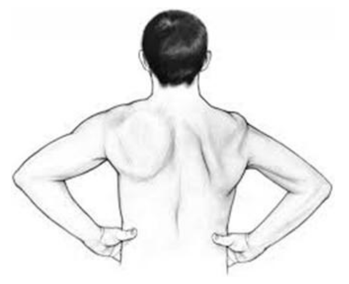
Figure 1. Manifestation of right long thoracic nerve damage [12]

Breast anterior neuropathy causes a dysfunction called the winged blade. The symptom is the characteristic withdrawal of the spatula (Figure 1), particularly noticeable when the limb is extended and supported, eg on the wall. The checking test is the protrusion of the upper limb in the forward bend [12].