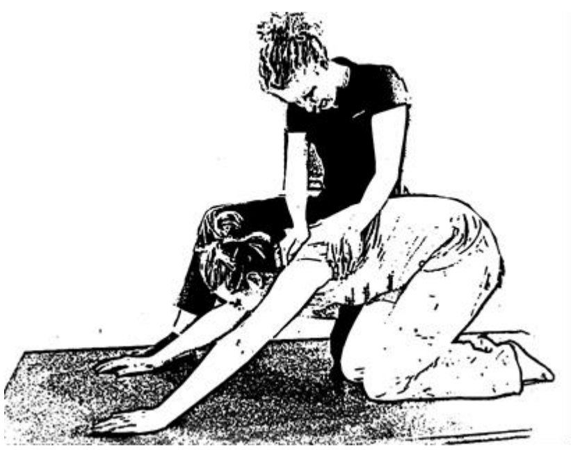
Figure 3. Work on the mobility and stability of the blade.

During exercises that affect the stability of the spatula, attention should be paid to whether the ascending part of the trapezius muscle is stimulated. With proper support activity, active lower torso flexors. If the ridge rectifiers turn on during the exercise, it may mean that the patient is pulling the retraction blade.