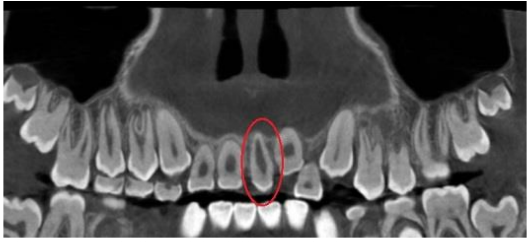
Fig. 3. Frontal slice with visible mesiodens.