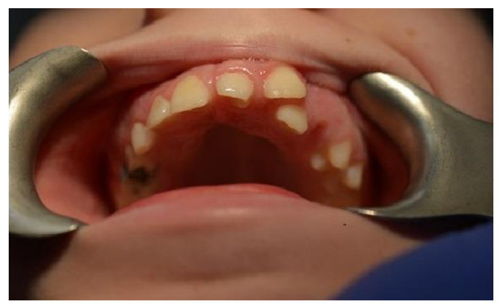
Fig. 1. Intraoral image of the patient.