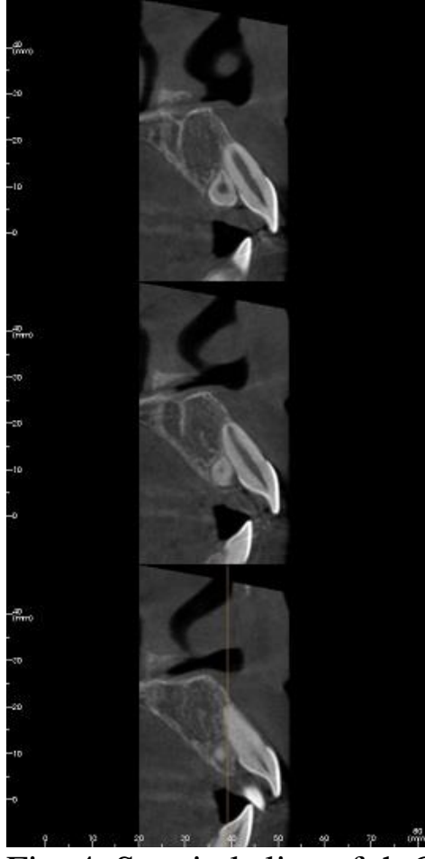
Fig. 4. Saggital slice of th CBCT showing the location of the supernumerary tooth towards the tooth 21.