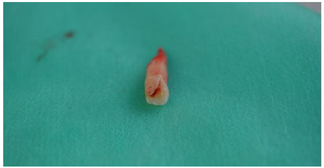
Fig. 5. Removed mesiodens