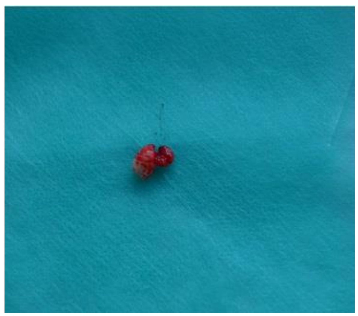
Fig. 7 Impacted supernumerary tooth.