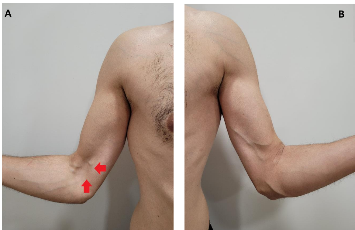
Figure 1. Shoulder on (A) right and (B) left sides. Significant atrophy of the brachialis muscle is seen on (A) the right side.

muscle. Later then, an orthopaedics suspected a tear of the brachialis muscle and ordered an MRI scan of the right elbow joint. An examination was performed on August 5, 2022, but no rupture of the brachialis muscle was confirmed, only showing diffuse swelling of the brachialis muscle, a volume reduction and the onset of fat infiltration ( Figure 3 ).