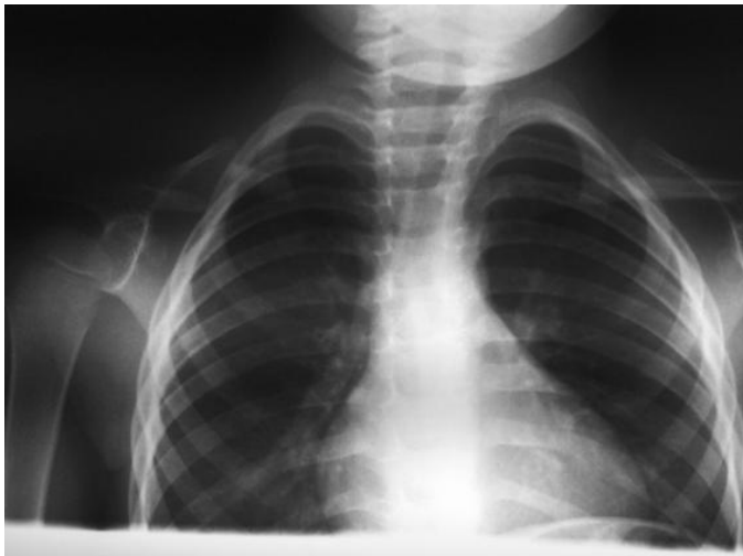
Figure 6. X-ray revealing pseudoarthrosis of the right clavicle

Necessary imaging studies, including X-rays ( Figure 6 ) and a Computer Tomography ( Figure 7 ), were performed, revealing a bone defect in the clavicle. It was decided to qualify the patient for surgical treatment.