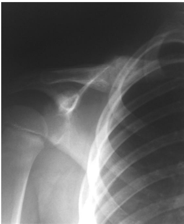
Figure 5. X-ray depicting proper bone union after the removal of fixation material