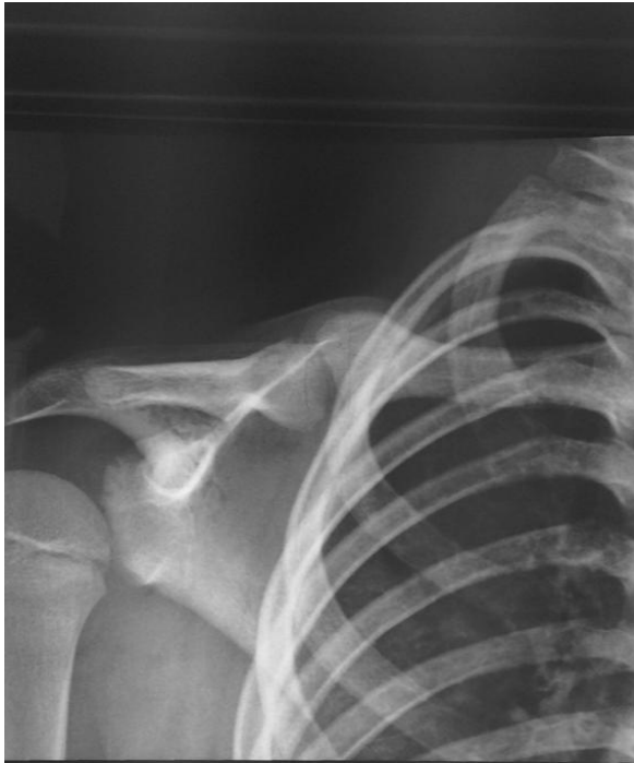
Figure 2. X-ray of the chest by the 6 year-old patient