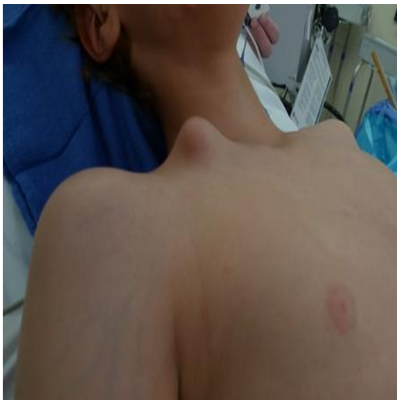
Figure 3. Photograph illustrating the patient deformity

The patient underwent surgery in the Orthopedics Department, during which the decision was made to perform a resection of the pseudojoint along with intramedullary stabilization ( Figure 4 ), and the defect was filled using the ChronOs preparation.