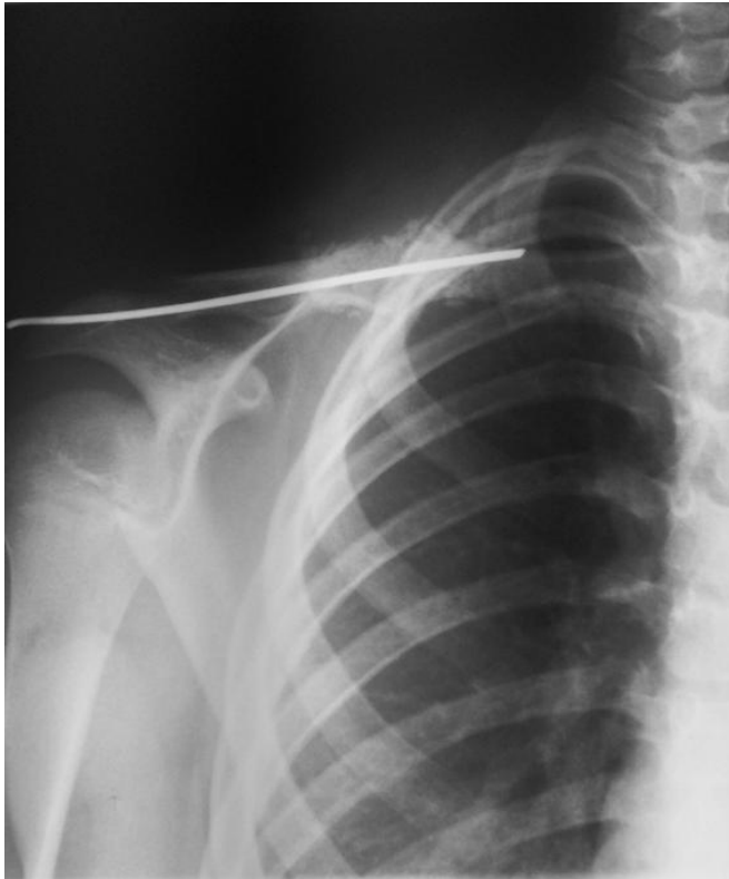
Figure 4. Post-operative X-ray by the 6-year-old patient demonstrating intramedullary stabilization