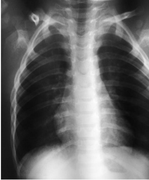
Figure 1. X-ray showing the pseudoarthrosis of the right clavicle.

The physical examination exposed a CPC located 3 cm from the acromial end of the clavicle. According to the mother's account and medical documentation, the deformity was diagnosed when the child was 2 years old. However, no further treatment decisions were made at that time.