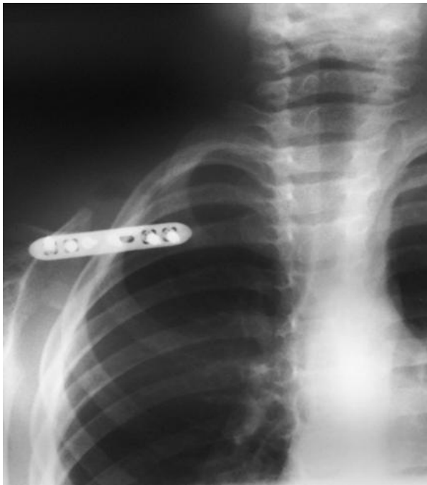
Figure 8. Postoperative X-ray with LCP plate on the right clavicle

Due to the size of the defect (1.5 cm), a resection of the pseudojoint was performed along with the defect being filled using an autogenous graft from the hip bone's head. Stabilization was achieved using a LCP plate ( Figure 8 ). The length of the right clavicle was restored to match the healthy side. Additionally, the operated area was covered with a membrane, and platelet-derived growth factors were administered ( Figure 9 ).