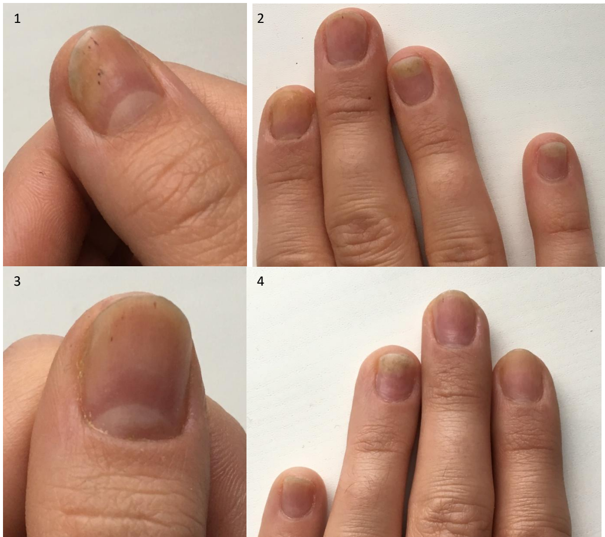
Figures 1-2 presenting nail plates of right hand, figures 3-4 presenting nail plates of left hand. Symptoms include yellow discoloration, subungual hyperkeratosis, onycholysis and splinter haemorrhages.

A 22 year old female patient was admitted to the outpatient department of Dermatology and Venereology complaining about nail changes. She presented the symptoms of yellow discoloration of nail plate and onycholysis present on all hand fingers and five feet fingers. Moreover in physical examination elevation of nail plate and splinter haemorrhages were detected, however there were no signs of inflammation (paronychia), including pain, edema, redness or warming. Pictures showing affected nails are presented below the text as Figures 1-5. Patient had a history of three and a half year exposure to hybrid varnishes, applied at home regularly once every three weeks with the use of home acrylic nail kit. Symptoms developed within one month period. Suspecting fungal infection, patient applied nail polish with amorolfinum for two months, however further nail changes development was observed what eventually led to visiting the doctor. After physical examination was performed, a scrap from nail plate was taken for mycological tests and treatment was modified to nail polish with ciclopiroxum, furthermore the necessity of nail painting withdrawal was marked. New treatment method was successful, moreover the mycological test results received after a month revealed the presence of fungus Throdotorula rubra , what motivated the effectiveness of the therapy. After few months symptoms subsided when new nail plate replaced the old one.