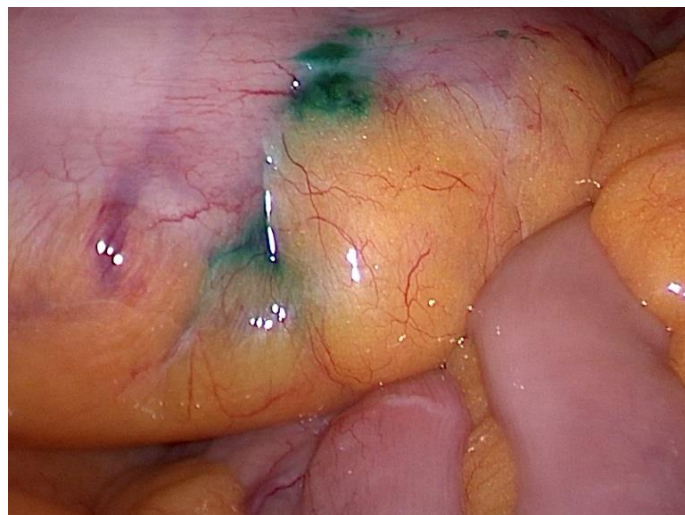
Fig. 2. Stained sentinel lymph nodes during laparoscopy

In all the patients of this group after performing local excision of tumors using the TEM technique with taking into account a high risk of recurrence and metastasis, the standard TEM technique was added with an express histological examination of the sentinel lymph node. The patient’s treatment was started according to the standard TEM method, then 1–2 ml of ICG dye was injected into the submucosal layer of the tumor. In 15 minutes after staining laparoscopy was performed to dissect the stained regional lymph nodes (Fig. 2).