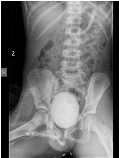
Figure 2. Videocystometry after STING procedure in the presented patient at the age of 8. Note the resolution of VUR

There were neither incidences of bedwetting nor daytime urinary incontinence unless the patient was holding the urine.