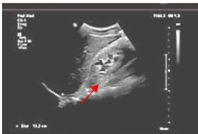
Figure 3. Ultrasounds of the right kidney in the presented patient at the age of 14. Note moderately dilated and slightly deformed pelvicalyceal system (calyces' width up to 9 mm, AP pelvis size 18 mm) – arrows

At the age of 11 renal US showed right kidney pelvis dilation (AP 22mm) and micro-deposits in the bladder. Consequently, the assessment of metabolic risk factors of urolithiasis was performed and revealed hypercalciuria (4,61mg/kg/24hours) without any other abnormalities. Family history for urolithiasis was positive (mother and grandmother on the mother side). Preventive fluid and dietary therapies were introduced. In subsequent US pelvicalyceal system of the right kidney was enlarged and deformed without visible concerns neither in the kidneys nor in the bladder (Fig. 3).