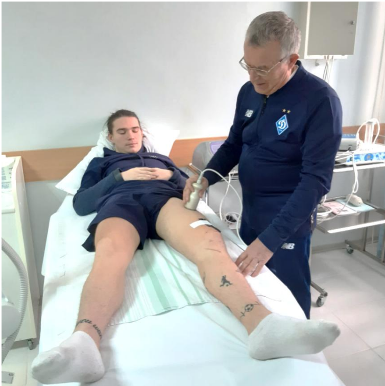
Fig. 1. An example of the procedure for a patient of group 2.