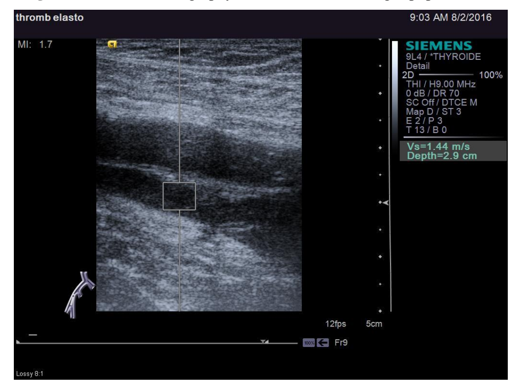
Figure 2. Thrombooelastography of the thrombosis of the right common femoral vein

The determination of indexes of the coagulation and fibrinolytic system was performed: fibrinogen was determined by gravimetric method according to R.A. Rutberg; activity of the fibrin stabilizing factor (F XIII) – by means of the "set for determination of