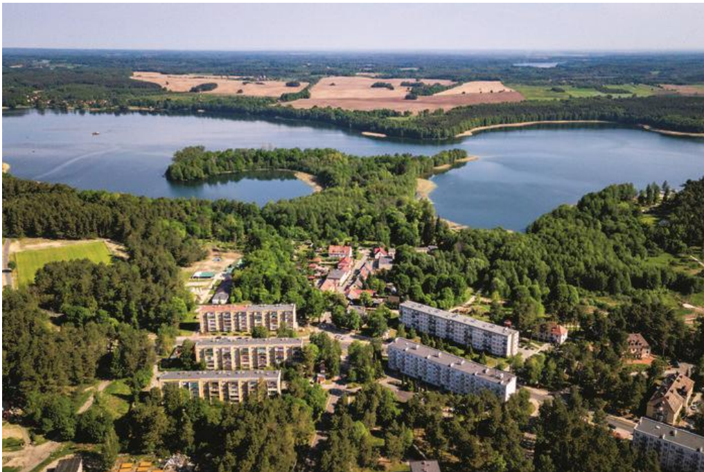
Figure 2. The landscape of Borne Sulinowo