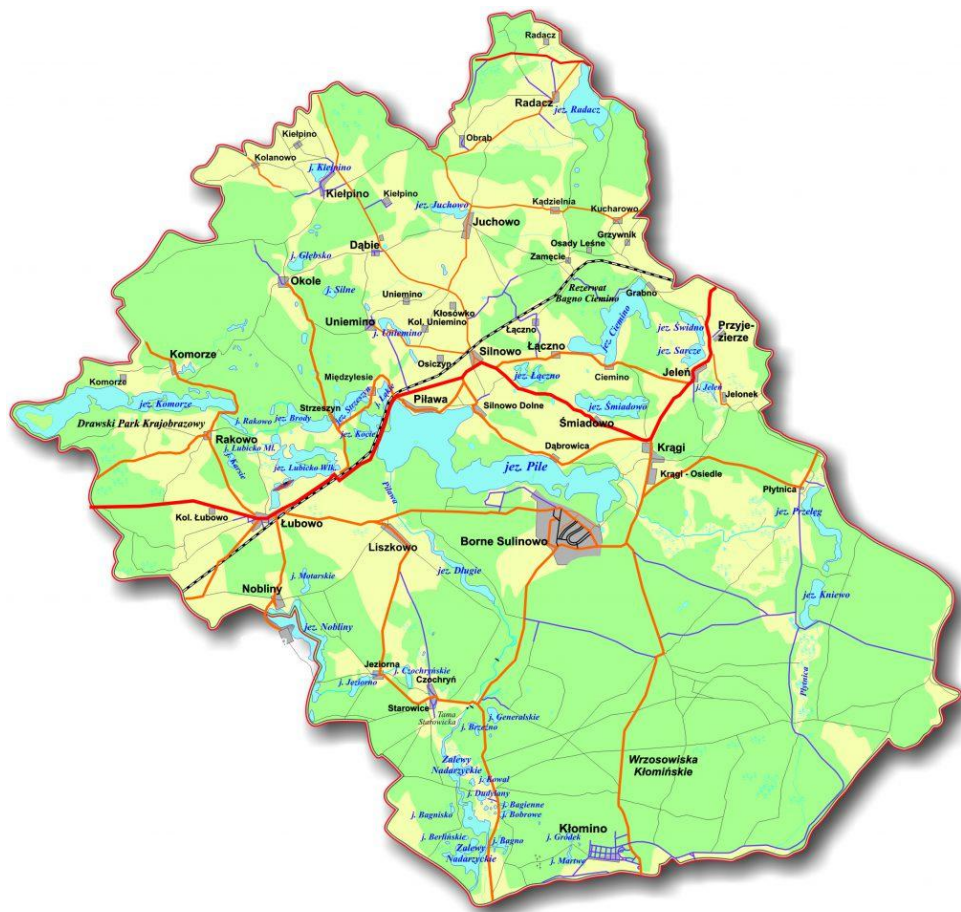
Figure 1. The Map of Borne Sulinowo Commune