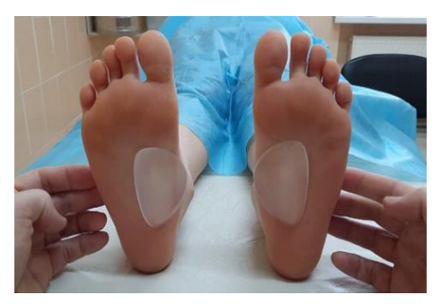
Figure 3. Positioning of the medial arch using silicone pelottes for patient B. 12 years old

In the variants of the flattened and flat-valgus foot, the inner arch is modeled using silicone pelottes (Fig. 3).