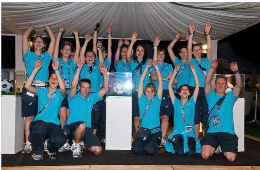
Fig. 1. Enthusiasm and passion to volunteering presented by volunteers working in the sports zone of UEFA Euro 2008™ in Austria and Switzerland.

Key requirements for candidates in both programs were identical. Adult of age in late March and early April 2012, communicative English skills and availability during the tournament which were the minimum required of people who wanted to take part in the program. In addition, the main organizer of the tournament, encourage them to participate in youth program and put attention to the personal skills of candidates. It was also highlighted that they are looking for volunteers who will bring the passion, enthusiasm and energy to the program as in previous UEFA Euro tournaments (Fig. 1).