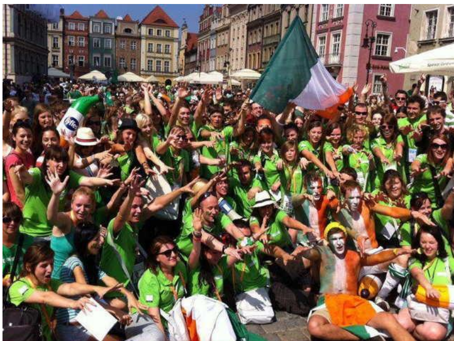
Fig. 2. Volunteers working in the municipal area of the UEFA Euro 2012 in Poznan integrated with Irish football fans.

Center for Urban Transport – CKM emphasized the social nature of its program encouraging the participation under the slogan "We are the hosts" while pointing out that it is a work in urban space gives you the feeling of a real host of the tournament. Participation in this program was to build the atmosphere of a football feast through integration with other program participants, fans and tourists (Fig. 2).