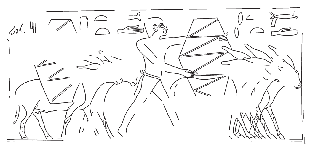
2. Somali wild asses represented in the tomb of Pepyankh the middle (Meir), west wall.

a black spot on the lower part of the animal's neck.<sup>22</sup> This marking, which is known as 'collar buttons', is small and circular spots of dark hair found on the neck of some donkeys.<sup>23</sup>