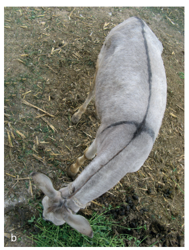
1. Donkey with the chestnut as well as shoulder and dorsal stripes.

to the early Sixth Dynasty, <sup>12</sup> as well as in other tombs, <sup>13</sup> a farmhand is shown holding an unyielding donkey by one leg and one ear in an attempt to render it motionless, <sup>14</sup> which demonstrates the Egyptian understanding of the behavioural traits of his animal and how to deal with them. In Tjy's tomb a small donkey walks in front of its mother to entice the latter to move. Furthermore, the artist demonstrated his familiarity with the physical details of the animal's body by regularly showing the chestnut on the inner side of the foreleg, above the knee. <sup>15</sup> The chestnut ( Fig. 1a ), also known as a night eye, is a dark 'elongated horny outgrowth of the skin' <sup>16</sup> which is found on the forelegs of donkeys and horses, and the latter also have it on the hind legs. Its shape and size vary and are subject to changes over time. <sup>17</sup> One of the features differentiating races of assess is the dark shoulder stripes. <sup>18</sup> The shoulder and dorsal stripes resemble a 'cross' marking on the back and shoulders of the animal ( Fig. 1a-b ), <sup>19</sup> and this characteristic is also drawn by Tjy's artist. <sup>20</sup> The chestnut and the cross are occasionally observed by artists, as we see in the tomb of Pepyankh the middle of Meir (early Pepy II). <sup>21</sup> However, the artist of Pepyankh the middle curiously drew