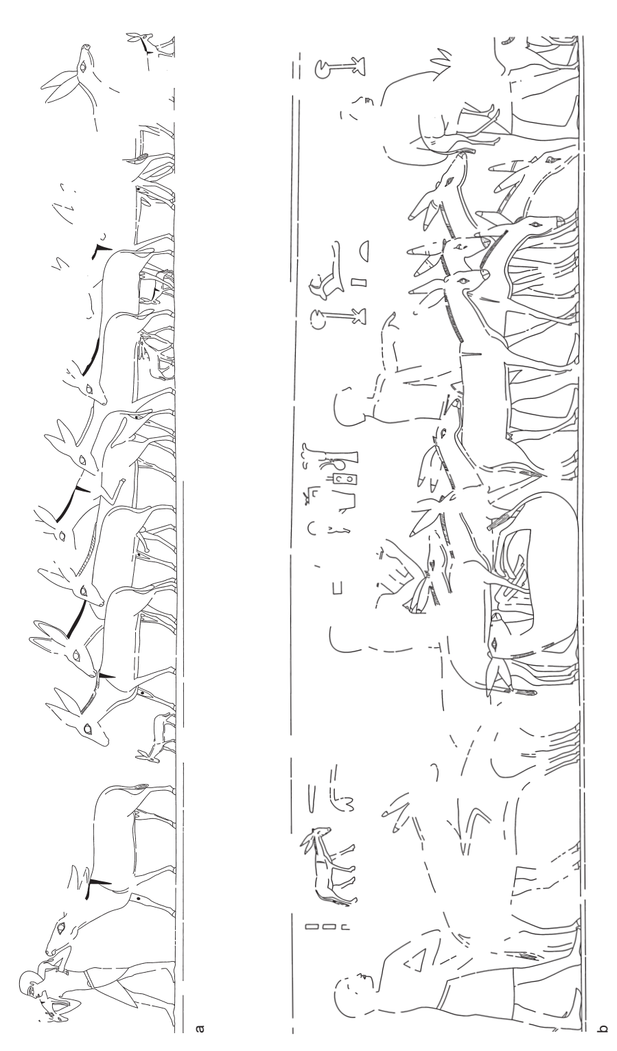
4a. Tomb of Baqet III (Beni Hassan), south wall; b. tomb of Khnumhotep II (Beni Hassan), north wall; not to scale.