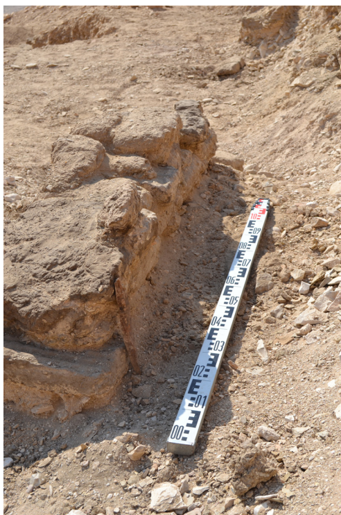
4. Wooden peg by the shrine corner.

courtyard wall. 11 Its upper edge was located at a depth of 1.5m below the level of the courtyard. The chamber, c. 2.5m long, was aligned with north-south axis. The examination of the fill of the shaft revealed material from the Middle Kingdom as well as from the Late period.