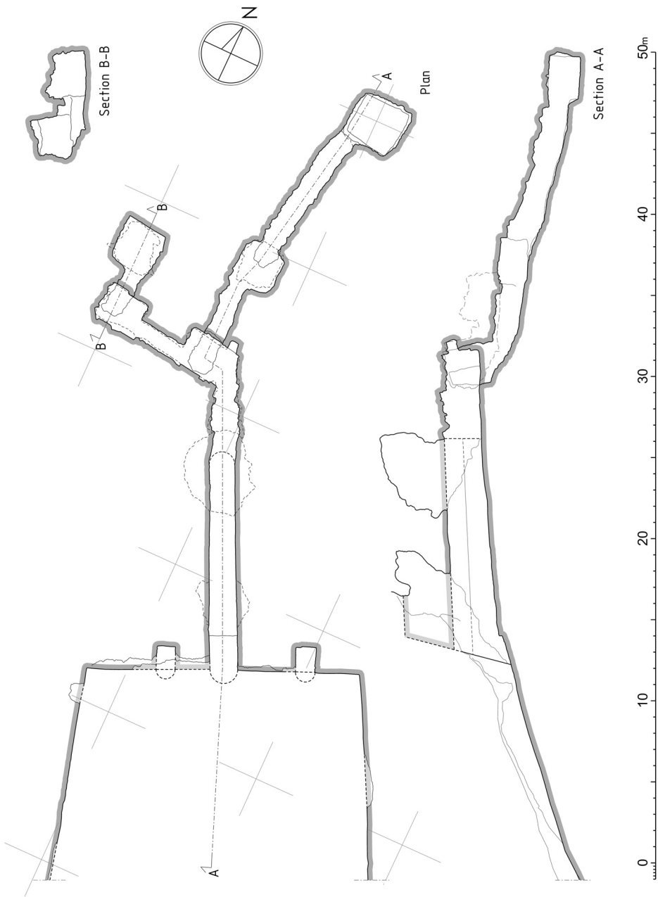
3. Plan and section of Horhotep's tomb (Drawing: M. Caban).