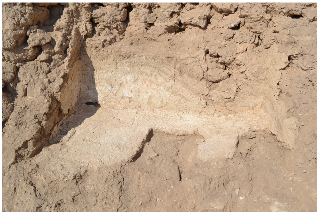
5. Western niche of the façade with a negative left by a small rectangular stone basin.