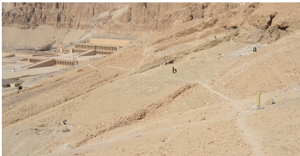
1. Courtyard of Horhotep's tomb complex: a. tomb entrance, b. accompanying tomb, c. mud brick shrine.

complexes are associated with the beginning of that period. Only a few others were built slightly later, mainly during the reigns of the Twelfth Dynasty rulers. The tomb of Horhotep, 'the guardian of the royal seal', who lived in the times of Kheperkare Senwosret I (see below, footnote 8), is one of them.