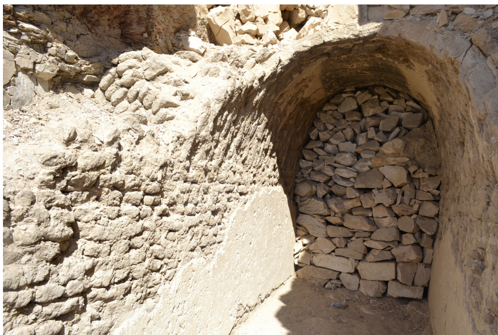
6. Mud brick walls with a barrel vault in the entrance corridor.