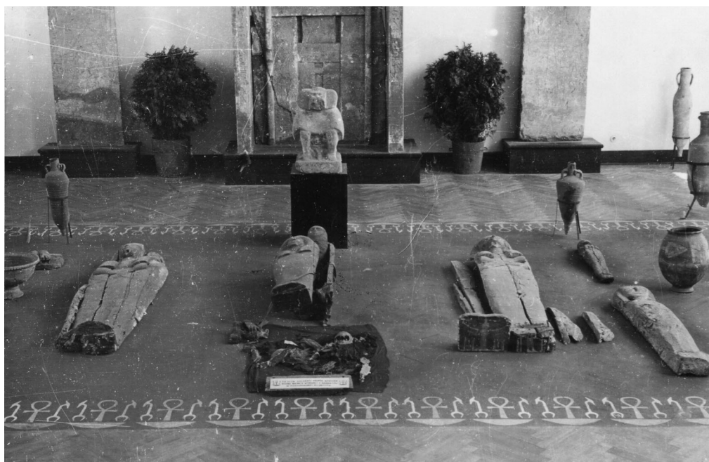
8. Egyptian antiquities presented during the 'Warsaw Accuses' exhibition in 1945 (National Museum in Warsaw: DI 133660/1).

and its bandages torn apart in search of jewels. 85 Several months after the aforementioned photograph showing the pseudo-mummy lying on the floor in a storeroom was taken, the same object was exhibited at the 'Warsaw Accuses' exhibition, when, for reasons which remain unknown, it was placed in an unrelated Eighteenth Dynasty wooden coffin from Deir el-Medina inscribed for a boy named Userhat (138980 MNW). Nevertheless, the pseudo-mummy was not destroyed, but probably only slightly damaged. Therefore, it should not be grouped together with the other two mummies that were destroyed by German soldiers.