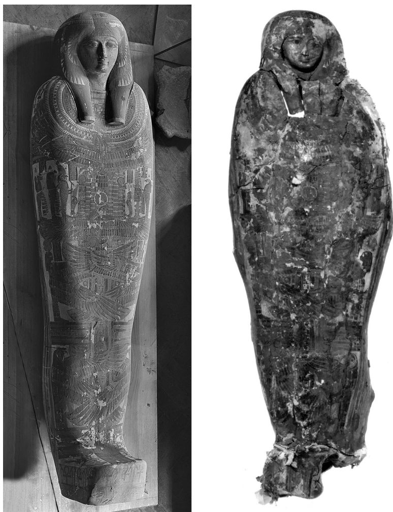
10. Cartonnage of Nehemes-Bastet (238435 MNW) before and after its destruction during the war (National Museum in Warsaw: photographic numbers unknown).

Very late period, probably Roman'. 95 The incorrect dating of the object fits into Bernhard's aforementioned statement that the two destroyed mummies were dated to the Ptolemaic and Roman periods, but the cartonnage, in fact, dates to the Twenty-second Dynasty.