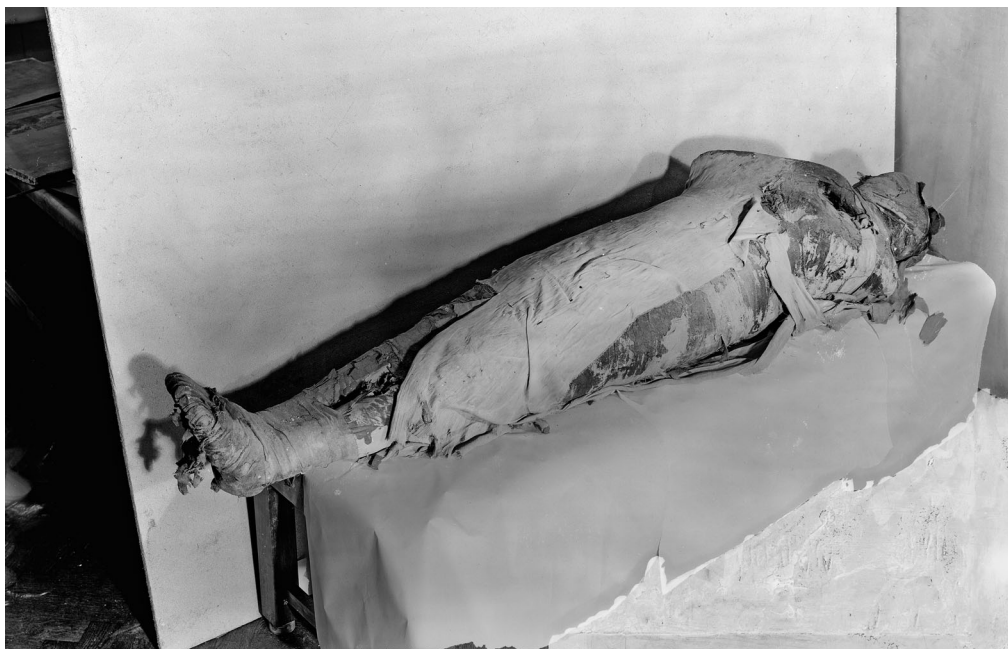
4. Mummy of an anonymous woman (deposit of the University of Warsaw Museum in the National Museum in Warsaw: 236805/3 MNW) in 1941 (National Museum in Warsaw: DDWneg.4793).