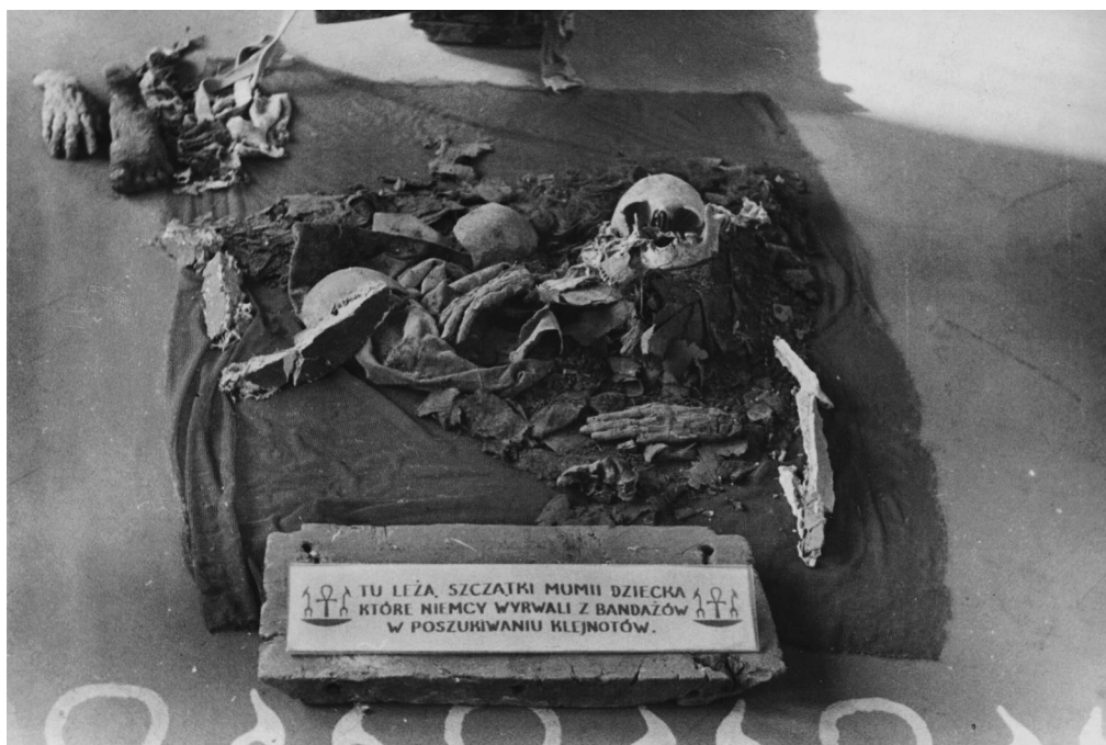
9. Mummified remains presented during the 'Warsaw Accuses' exhibition in 1945 (National Museum in Warsaw: DI 133662).

which suggests that this is a group of mixed human remains. It is unknown whether it was intentional to add the mummified fragments to enhance the visitor's impression of this desecrated and destroyed mummy, or if the remains were stored in one crate during the war and thus may have been chaotically mixed during the looting of the collection. Nevertheless, the provenance of the skeletal remains visible in the photograph – likely identified as some of the bones registered under reference KMS 743 MNW – remains unknown. There are, in fact, two possible options concerning its provenance, discussed below.