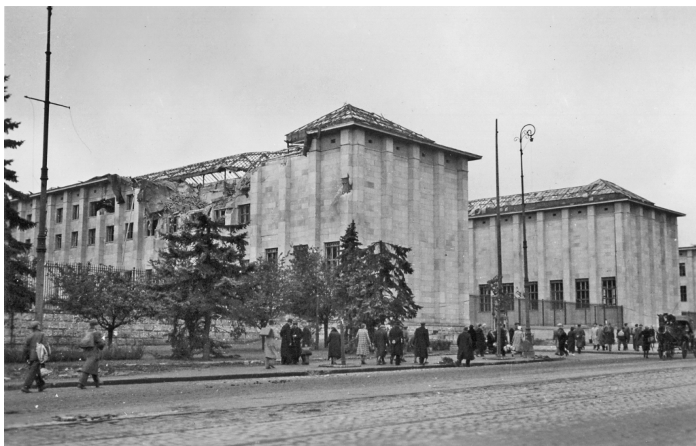
2. Damaged building of the National Museum in Warsaw after the capitulation of Warsaw in 1939.

into the basement just a few meters from the crates containing the antiquities. 16 This event probably occurred on 25 September 1939, when a stela, which can probably be identified as the Sixth Dynasty stela of Sabni (138874 MNW) from Tell Edfu, is reported to have been destroyed by a German aerial bomb. 17 Bernhard mentioned that some objects were still in exhibition rooms, while the blast and tremor destroyed the glass in the windows as well as the showcases. 18 It was likely soon after that when Polish photographer Henryk Śmigacz (1911–1972) immortalised the view of the devastated first room of the Gallery of Ancient Art ( Fig. 3 ). In his glass plate negative a large amount of broken glass can be seen covering the room as well as the broken showcases, one of which contains the aforementioned damaged coffin lid of Setau, which is visible in the lower-left corner. Friedel-Bogucka additionally noted: ‘Some damaged objects in the rooms. The most were in Egypt. The fewest objects were packed there, and that is where the shell hit; it flew through the window and exploded in the middle of the room’. 19 According to Bernhard, after the destruction, objects continued to be evacuated from the exhibition rooms to the basement, which was stopped due to the need to move the most valuable items from the burning Royal Castle to the museum and resulted in leaving the objects of lesser value in the devastated rooms. 20