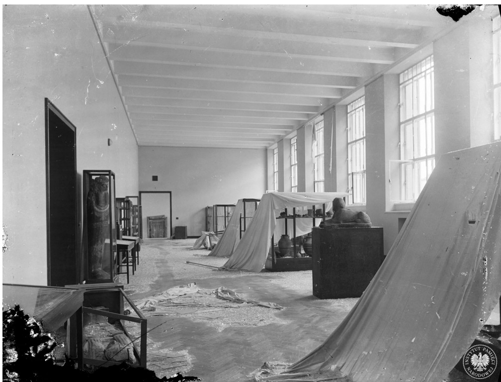
3. The devastated first room of the Gallery of Ancient Art photographed by Henryk Śmigacz in September 1939 (Archive of the Institute of National Remembrance in Warsaw: IPN BU 4111/14, k. 5; the CC BY-NC-ND license does not apply to this illustration).

When the fighting stopped, objects were extracted from the rubble and temporarily moved to the three small, less damaged side rooms. 21