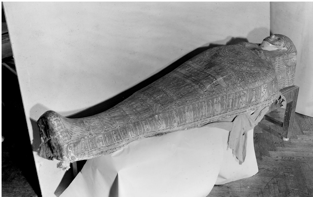
5. Mummy of an anonymous woman covered with a cartonnage case (deposits of the University of Warsaw Museum in the National Museum in Warsaw: 236805/3 MNW and 236805/2 MNW) in 1941 (National Museum in Warsaw: DDWneg.4801).