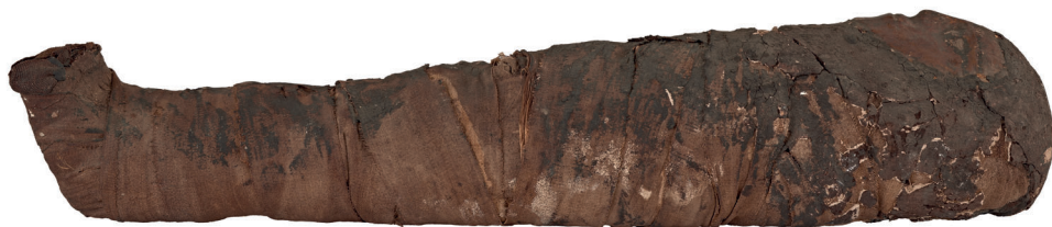
7. Pseudo-mummy of a child (deposit of the University of Warsaw Museum in the National Museum in Warsaw: 200334 MNW) – current state (reproduced with the permission of the University of Warsaw Museum).