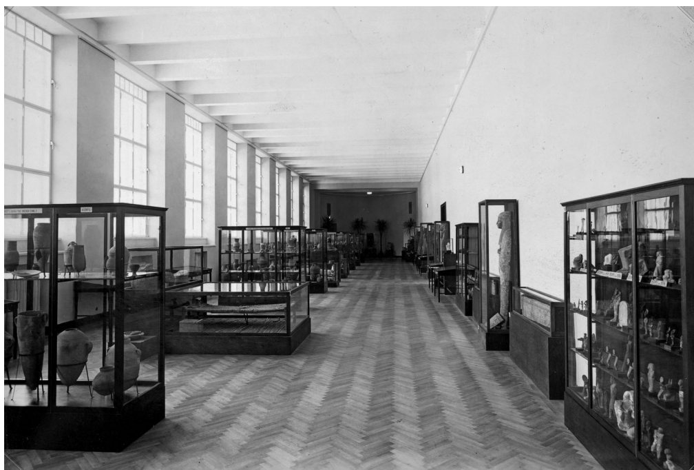
1. First room of the Gallery of Ancient Art in 1938 (National Museum in Warsaw: DI 102899).

of the National Museum in 1937 for a two-month period. The temporary exhibition was a huge success, reportedly visited by over 60,000 people, 2 and had a considerable impact on the creation of the permanent exhibition. The latter was officially inaugurated in June 1938 and presented not only objects obtained during the Polish-French excavations at Tell Edfu, but also objects from earlier French excavations at this site, and also at Deir el-Medina and Meir; gifts from the French Institute for Oriental Archaeology in Cairo (Ifao) to the University of Warsaw, which deposited its artefacts on long-term loan to the National Museum. Additionally, the collection was enriched with objects from older collections of the University of Warsaw, the Society for the Encouragement of Fine Arts in Warsaw (Zachęta), along with numerous gifts and deposits obtained from other institutions and private individuals. The collection of the newly established department, which numbered between 4,000 3 to 6,000 4 objects in 1938, was housed in five rooms on the ground floor of the museum ( Fig. 1 ), where Egyptian artefacts dominated both in number and quality. 5 In 1938, Michałowski was chosen to be the first head of the Collection of Ancient Art, while in the same year Maria Ludwika Bernhard (1908–1998) became the first assistant