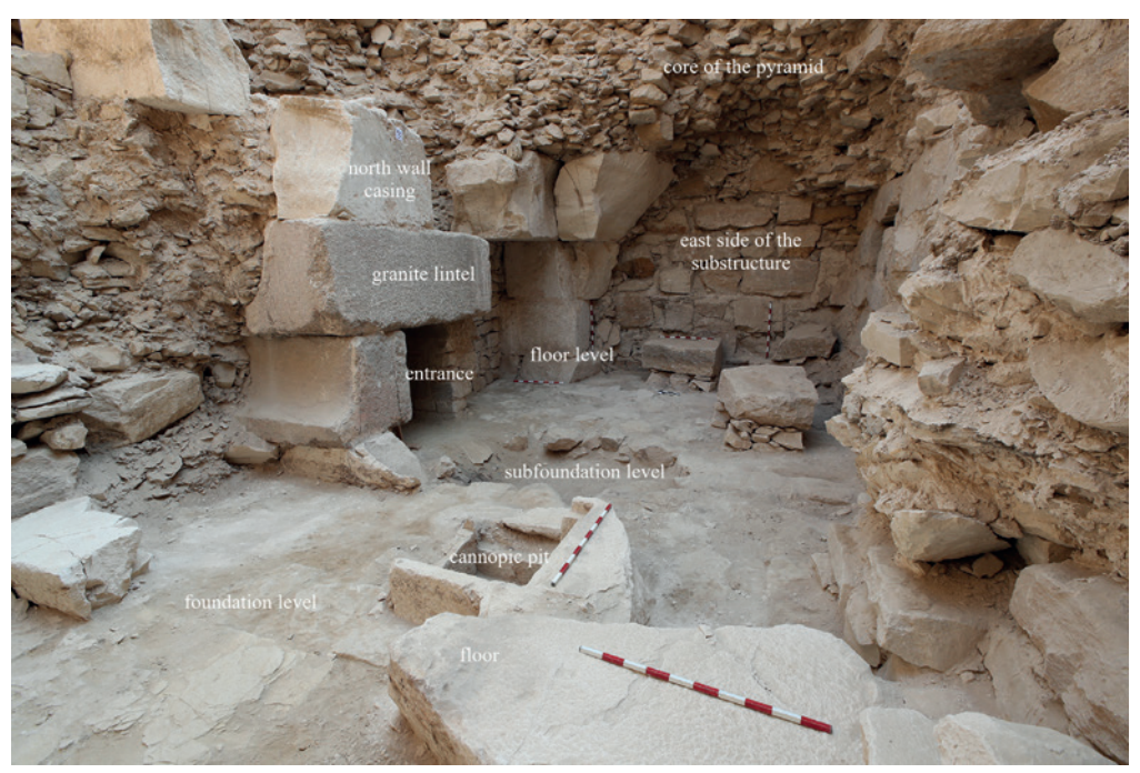
4. The substructure of Setibhor's pyramid after the cleaning (Phot. P. Košárek; © Djedkare Project).

his notes. The horizontal passage in pyramid substructures of the Old Kingdom usually contained blocking systems, and this was also the case in the substructure in Djedkare's pyramid.<sup>19</sup> Due to the missing parts of masonry in Setibhor's corridor, it however remains unknown whether this part of the corridor originally contained any blocking mechanisms.