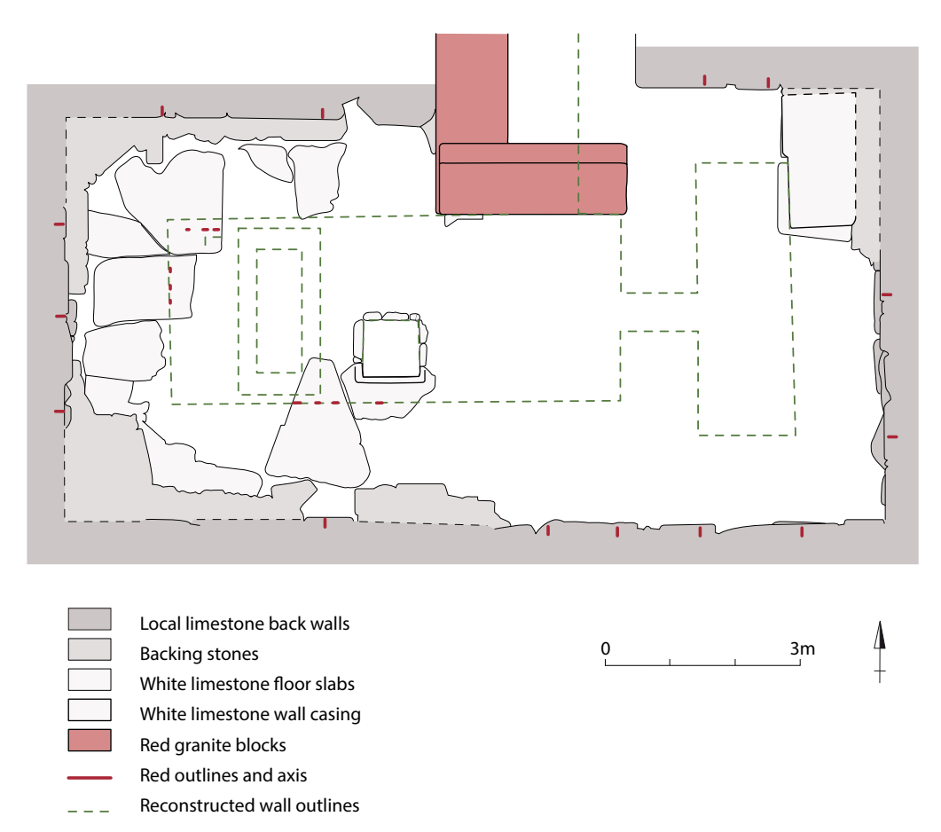
6. The ground plan of the substructure of Setibhor's pyramid showing the reconstructed layout of the burial chamber and the serdab (Drawing: H. Vymazalová).

this evidence, it has been possible to reconstruct the original layout of the inner rooms with a high degree of certainty. The area was divided into two rooms: the queen's burial chamber on the west and a smaller room to the east ( Fig. 6 ). The entrance from the access passage was in the north-east corner of the burial chamber, which was east—west oriented. The outlines on the floor slabs show it was 2.80m wide, and the lines on the masonry indicate that it was 7.12m long and 3.10m high (about 13.5 \times 5 \times 6 cubits). The only blocks that remained from the original inner walls of the burial chamber are the granite blocks of the entrance and one white limestone block resting upon the granite lintel (see Fig. 4 ). Some of the backing stone walls, which filled the space between the grey limestone walls and the casing blocks of the chamber, are preserved along the north, west and south sides. Although