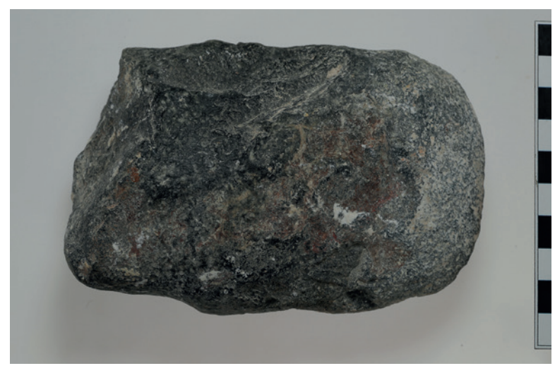
The dolerite pounder found in the eastern part of the substructure.

allowing the ancient stone robbers access from the top of the pyramid. Such evidence has been recorded in other Old Kingdom pyramids as well.<sup>20</sup>