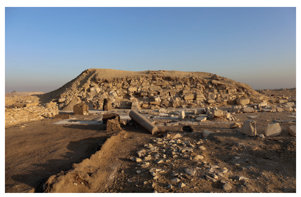
The pyramid of Queen Setibhor in 2018 with the cleaned core masonry on its southern face; in front of the pyramid are the remains of the portico giving access to the southern part of the funerary temple.

temple was situated in this area, including the entrance portico.<sup>14</sup> During this work, the identity of the owner of the monument was revealed on blocks with relief decoration and a granite column inscribed with the queen's titles and name: m33 Ḥr Sth wrt hts wrt hts hmt nzwt mrt.f St-ib-Ḥr, 'She who sees Horus and Seth, the great one of the hts-sceptre, greatly praised, king's wife, his beloved Setibhor'.<sup>15</sup>