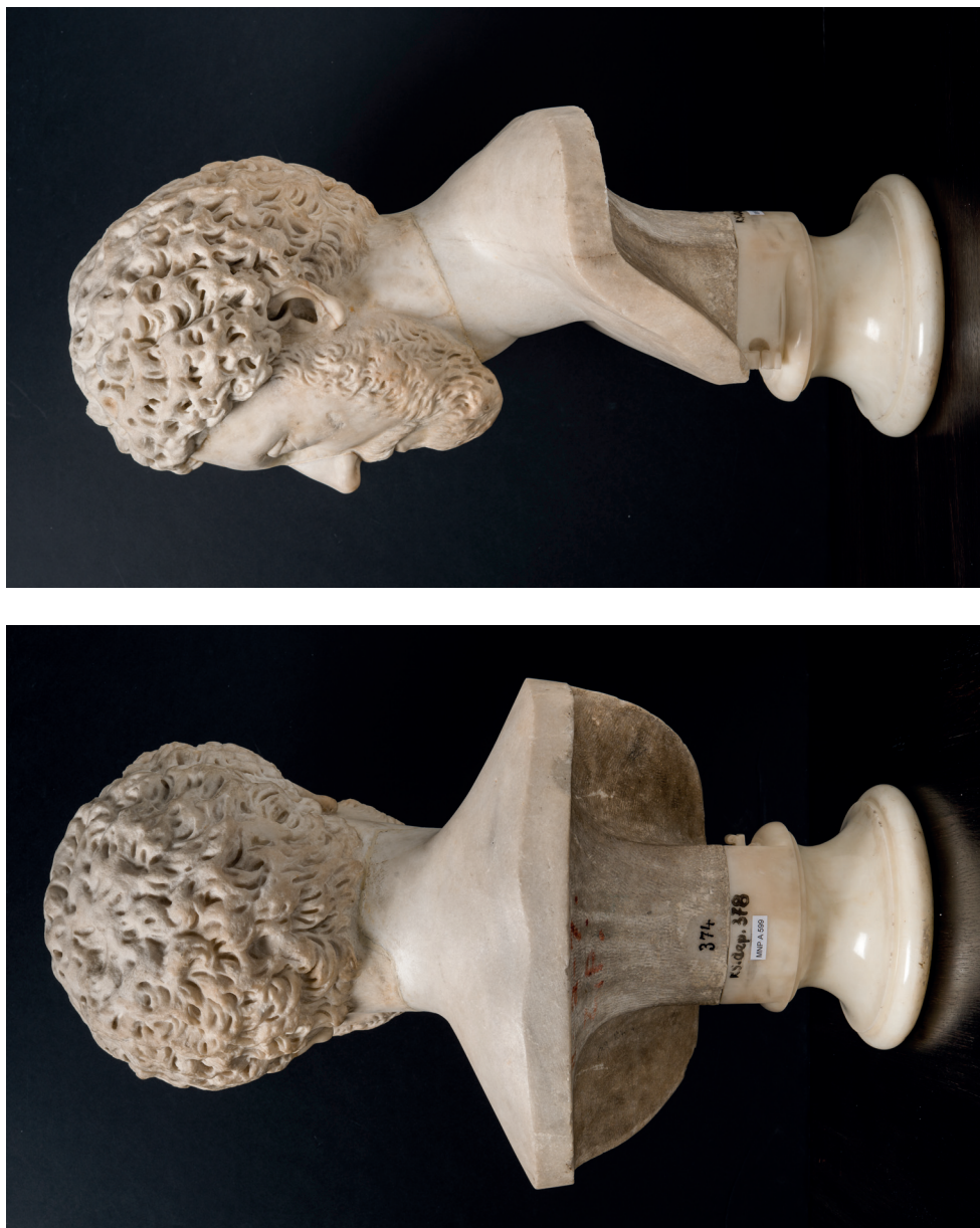
4. Portrait bust of Marcus Aurelius, MNP A 599, back and left side views (Courtesy of the National Museum in Poznań).