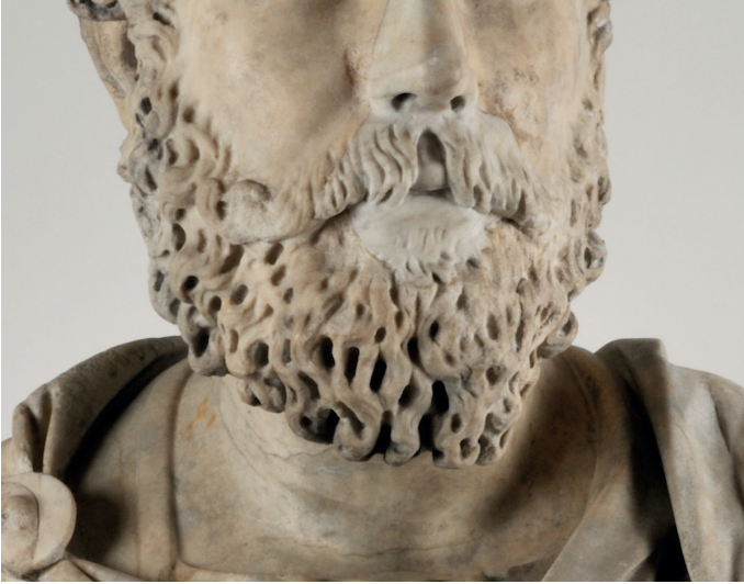
6. Reconstructed moustache of bust of Commodus/Marcus Aurelius, MNP A 594 (Courtesy of the National Museum in Poznań).

represents the almost wholly preserved bust from the Louvre no. 1127 and Mantua-Vatican type, which is presumably a later transformation in the bust of Pupienus. 66 The Poznań bust has all these features except one. Modern alterations – supplementing the nose and parts of the beard and curls – have changed the character of the sculpture and thus the emperor's depicted. Especially the moustache, which was supposed to imitate Mark Aurelius's beard, was exaggerated. Its ends are rolled up where they connect with the cheeks. Modelling is, furthermore, noticeably different from the rest of the representation. It is softer, shallower and less detailed than the expressively chiselled chin.