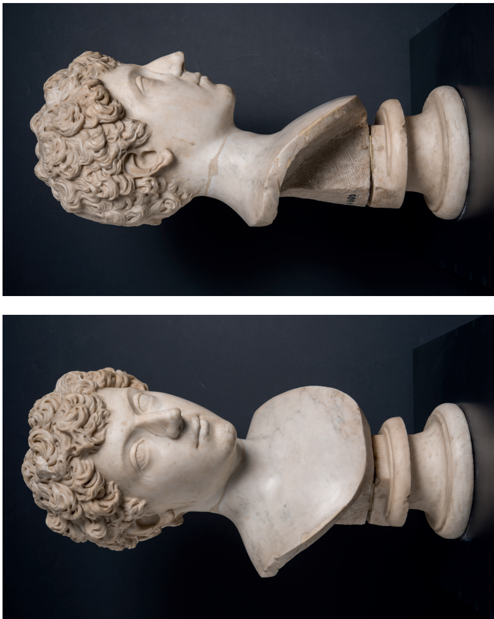
1. Portrait of young Marcus Aurelius, MNP A 603, frontal and right side views (Courtesy of the National Museum in Poznań).