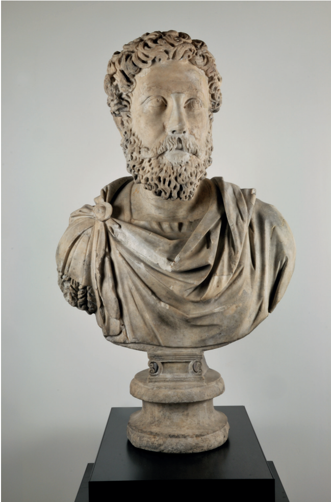
5. Portrait bust of Commodus/ Marcus Aurelius, MNP A 594.

upper lip and connects with the chin. Hair and beard are composed of deep curls arranged unevenly on one plane. Hair is shaped similarly at the back and above the occiput, fully braided into a bun or wrapped in material.