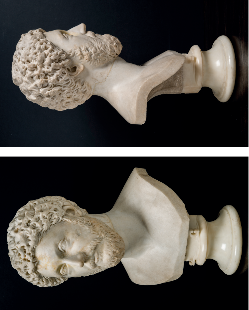
3. Portrait bust of Marcus Aurelius, MNP A 599, frontal and right side views (Courtesy of the National Museum in Poznań).