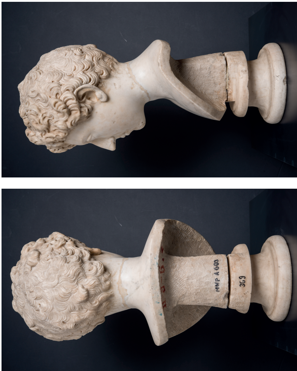
2. Portrait of young Marcus Aurelius, MNP A 603, back and left side views (Courtesy of the National Museum in Poznań).